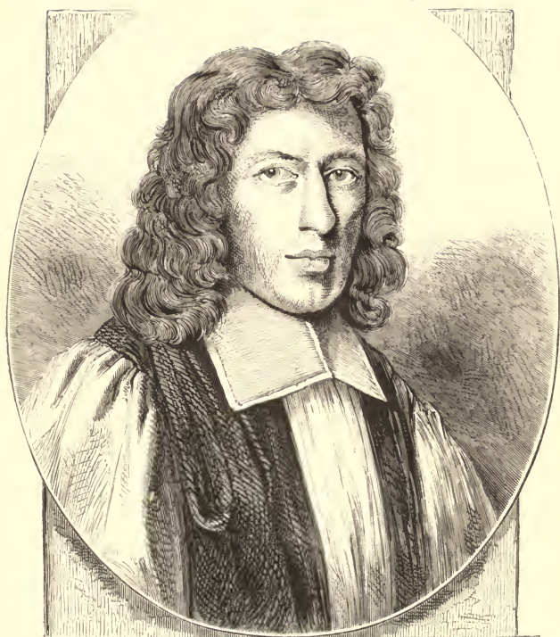
Effigies Reverendi in Christo Patris D: Simonis Patrick Eliensis Episcopi.