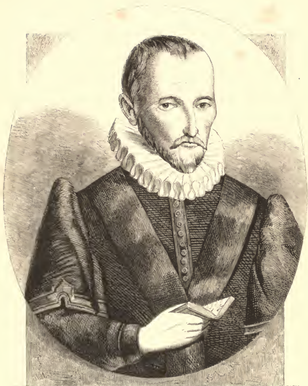
D'Hugo Broughton Theologus Literarum Et Linguar. Sacrarum Callentiss. Etatis 37.