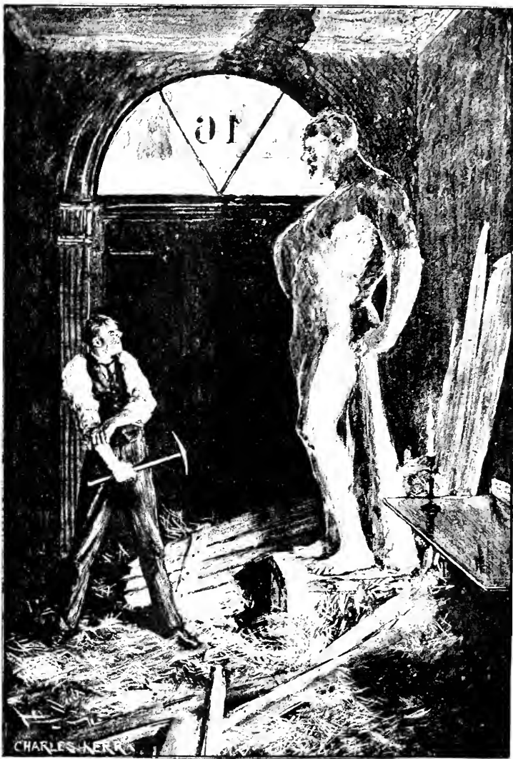
DOWN YOU SHALL GO IF YOU GET AT BIG EGGY BRUTE