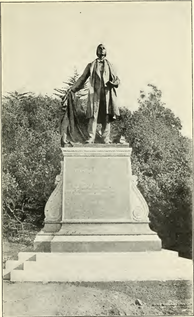
STARR KING MONUMENT IN GOLDEN GATE PARK, SAN FRANCISCO