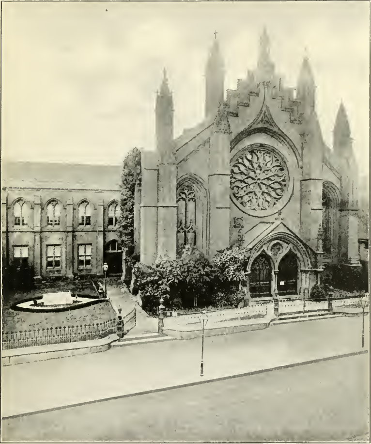
CHURCH AND TOMB OF THOMAS STARR KING IN SAN FRANCISCO