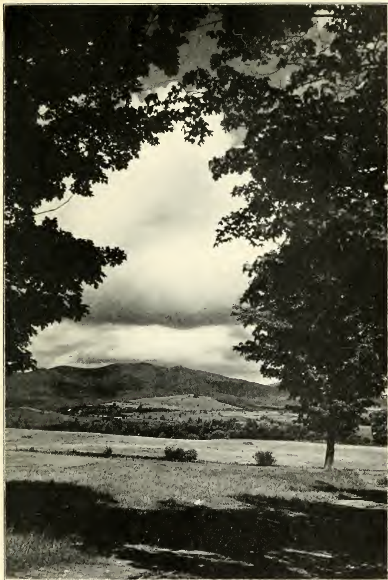
STARR KING MOUNTAIN, WHITE HILLS, NEW HAMPSHIRE From Whitefield, N. H.