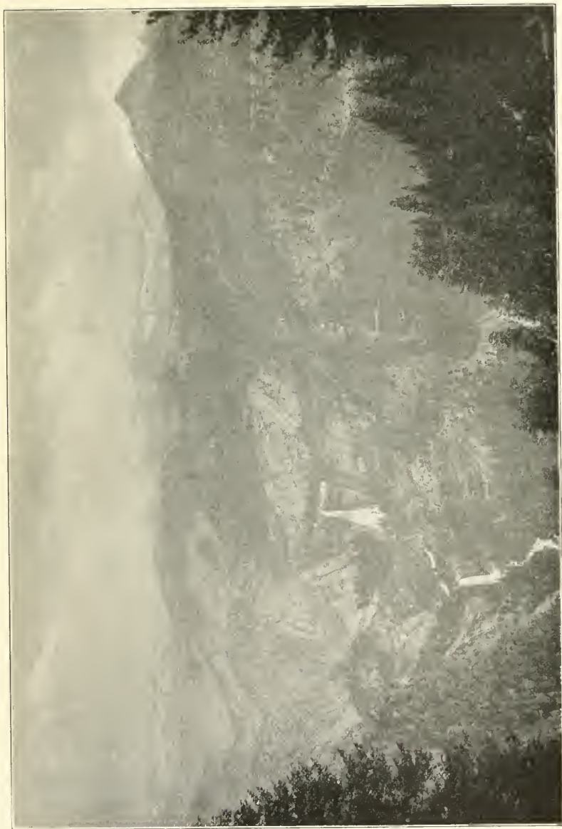
MOUNT STARR KING, YOSEMITE, SIERRA NEVADA