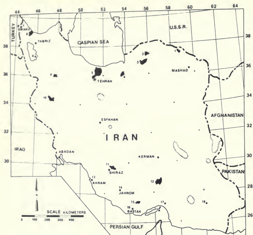
FIG. 1. Collecting localities of wild sheep and goats in Iran: 1, Tandoureh; 2, Mohammad Reza Shah National Park; 3, Khosh-Yeilagh Wildlife Refuge; 4, Parvar Wildlife Refuge; 5, Imperial Reserve; 6, Marakan Protected Area; 7, Maku; 8, Kabudan Island; 9, Bijar Protected Area; 10, Bisotoun Protected Region; 11, Bamou National Park; 12, Khabr-va-Rouchun Wildlife Refuge; 13, Ahrum; 14, Jahrom; 15, Hormoud Wildlife Refuge; 16, Bastak; 17, Minab; 18, Iranshahr and Bampur.

9. Bijar Protected Region ( 36^{\circ}06' N , 47^{\circ}40' E ), 1,500 m. Ovis: Haemaphysalis sulcata , Hyalomma anatolicum excavatum .