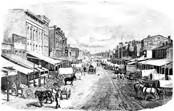
The Broadway, St. Louis, in 1858

When not busy writing books which became American classics, he was expounding the virtues of good tobacco. Frequently, however, he announced that he was forsaking his favorite pastime: smoking. No one believed him. What he was really doing was turning over a new leaf — in search of an equally good cigar. He lived a long, productive life, wreathed in smoke. His name was Mark Twain.