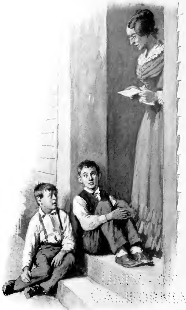
“I RECKON I GOT TO BE EXCUSED”