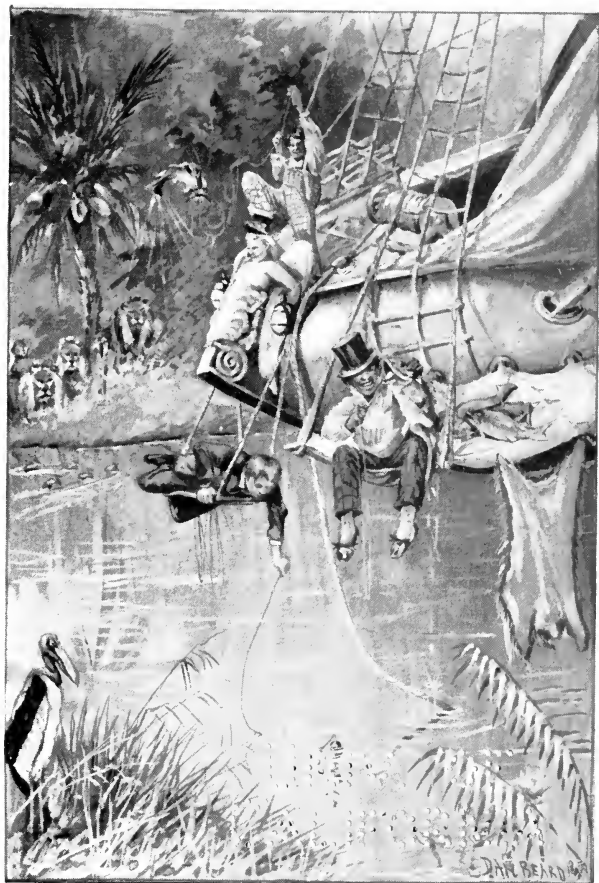
“WE CATCHED FISH”