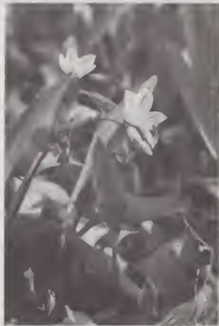
Spring Beauty.

Cloaked in soft, grey silk, a protection from the cold of nearby snow and the still frosty nights, waiting till the deepest cold has passed and most of the snow has melted, they then lift their buds through the litter and open their dainty flowers to the sun. Hepaticas grow in low clumps, four to six inches high. They are easily spotted next to the previous year's semi-evergreen, three-lobed leaves. The woolly new leaves lie fuzzily curled at the base of the flowers, and are partly hidden by last season's dead leaves and fallen twigs. Opening only on sunny days when early bees and insects are active, the usually light blue flowers are borne on hairy stalks. But often, because of cross-pollination at close range, the flowers may be white, pink, lavender or purple. They are members of the Buttercup family despite not being yellow. If you bend close to the plant, you will discover that some have a pleasant fragrance.