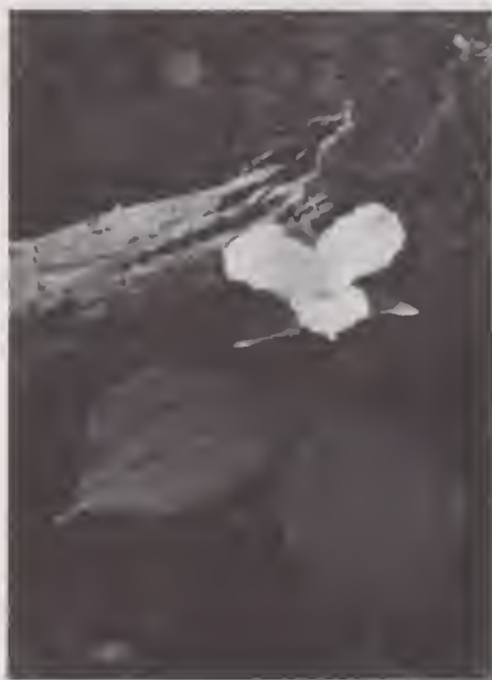
White Trillium.

Towards the end of the Hepatica season, one of the most unusual-looking woodland flowers appears, the eight-inch Dutchman's Breeches. The elongated racemes rise above clumps of soft fernlike foliage which sway with a feathery silvery grace when a breeze stirs the leaves and reveals their lighter undersides. The slender racemes bear several creamy-white pendant flowers tipped with yellow beaks. These flowers are worthy of closer inspection, for each is unusual in that it is made up of two sets of two petals which look like a tiny, jaunty pair of blown-up pantaloons attached at the waist to the stem. The flowers have a fragrant smell. With the advent of hot weather, around the first of July, the plant will have vanished.