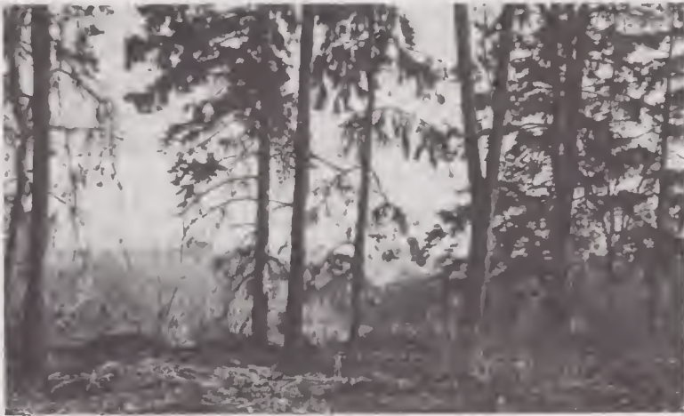
Fall 1994. Lots of leaves and the beginning of an understory, photo by Roger Camm.

P.S. We can always use help. We need habitat managers for the new woodlot and the sedge meadow. We need people to help weed, identify birds, bugs and plants; clean and repair bird boxes, and just generally keep an eye on things. Call me (730-0714).☐