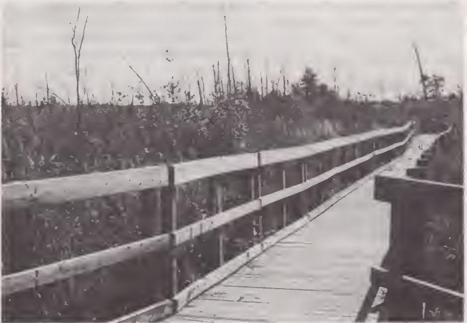
Alders are found alongside this inviting boardwalk at the BMC.

I work at the Bill Mason Outdoor Education and Environmental Studies Centre (BMC) near Dunrobin. Some of you have wandered there on your own, or on the OFNC wildflower walk in the spring of 1993.