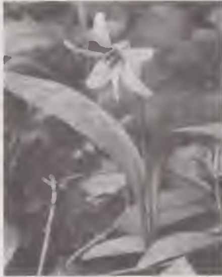
Trout Lily.

Our lengthening days and the warmth of a spring sun once more banish a winter-weary season. Heralding the changing tempo with lusty bravado, the peeping, trilling and croaking of frogs and toads in nearby ponds echoes throughout the woodlands. Local and returning songbirds join in early morning chorus, welcome sounds which mingle with the tinkling of icy brooks rushing towards creeks and rivers in seemingly gleeful, ever expanding streams.