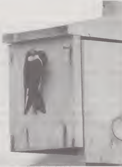
Male Tree Swallow guarding the nestbox, 25 May 1995.

For avid birders, there seems to be two distinct stages of becoming a serious birder. The first is to list all the birds you have seen in your lifetime or “lifers” as we like to call them. The second stage is installation of nesting boxes and feeders in your own backyard to observe birds in a more constant, close-up and entertaining way.