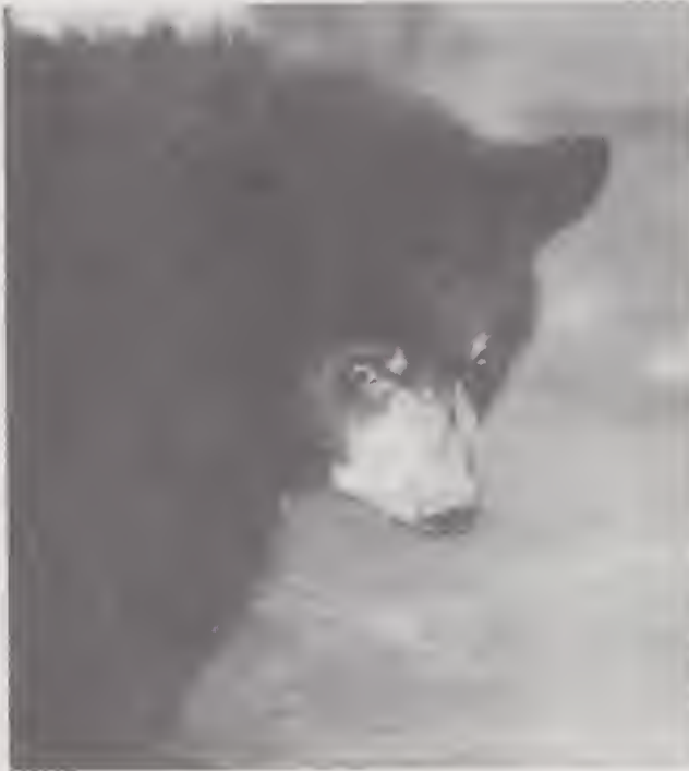
Captive cub, Oméga game-farm.

The large sow appeared relaxed and content after devouring the contents of the hiker's pack. With her black paws crossed and leaning against a spruce log, the black bear licked her lips and averted her eyes.