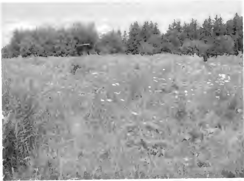
Old Field, July 2003.