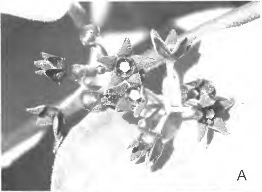
Figure 1. Flowers and flower buds of Vincetoxicum nigrum (A), and Vincetoxicum rossicum (B).