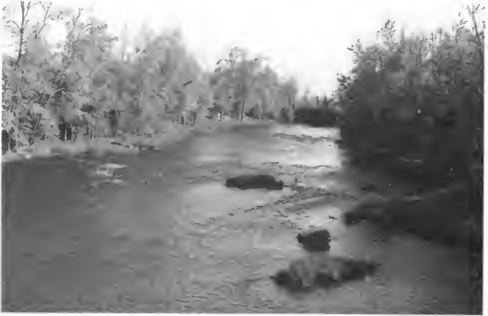
Rideau River on the west side of Long Island, Manotick

The underwater world is one of intrigue and misunderstanding. From aquatic mammals, and fish to microorganisms and bacteria, we can imagine how life must be. But do we really know? Limnologists studying aquatic systems cannot always agree on the importance of acid rain, nutrients, organic carbon, man-made contaminants and single stress events (e.g. major flooding). How then can public users be expected to evaluate water quality and understand some of the reasons for basic water conservation? Although the chemical dynamics of aquatic systems is complex, we can generally evaluate water quality with the understanding of basic water chemistry (Hutchinson 1957, Wetzel 1983, CCREM 1987).