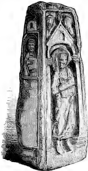
Fig. 1. Sculptured Cross Shaft from Hoddam. p. 12.

Kentigern 1 . It is of fine red sandstone, and measures two feet in height, nine and a half inches broad at the base, and is six inches thick. On the front of the stone is a draped figure standing under an arched pediment, having a nimbus, and holding a book in the right hand. Above the pediment are the heads of two figures, much defaced, probably of angels. On each of the sides is a half-length figure of a saint, each with nimbus and book. The back of the shaft has also been sculptured, but the carving has been nearly all chiselled or worn away. On the lower part, however, the outlines of two human figures can be made out. In all probability this portion of cross-shaft is of contemporary date with the famous rune-inscribed cross at Ruthwell.