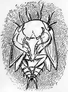
Fig. 9. Pupa, ventral aspect. \times 2 .

whose purpose is evidently to keep the body of the pupa from resting on the damp earth. The anus is terminated by two long sinuate cerci similar to those of the pupa of Hydrocharis figured by Schiøedte. Although incapable of locomotion, the pupa is far from motionless, but wriggles about and moves its abdomen freely on being brought to the light or touched. After spending three weeks in this state the perfect insect emerges.