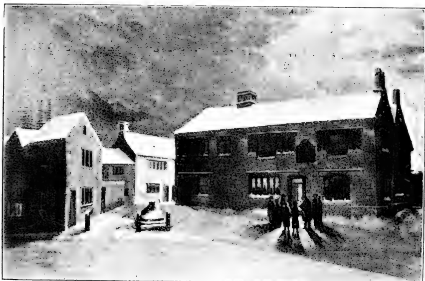
Original Oil Painting by] BURNLEY MARKET IN 1820. [the late Mr. Stocks Austerberry.