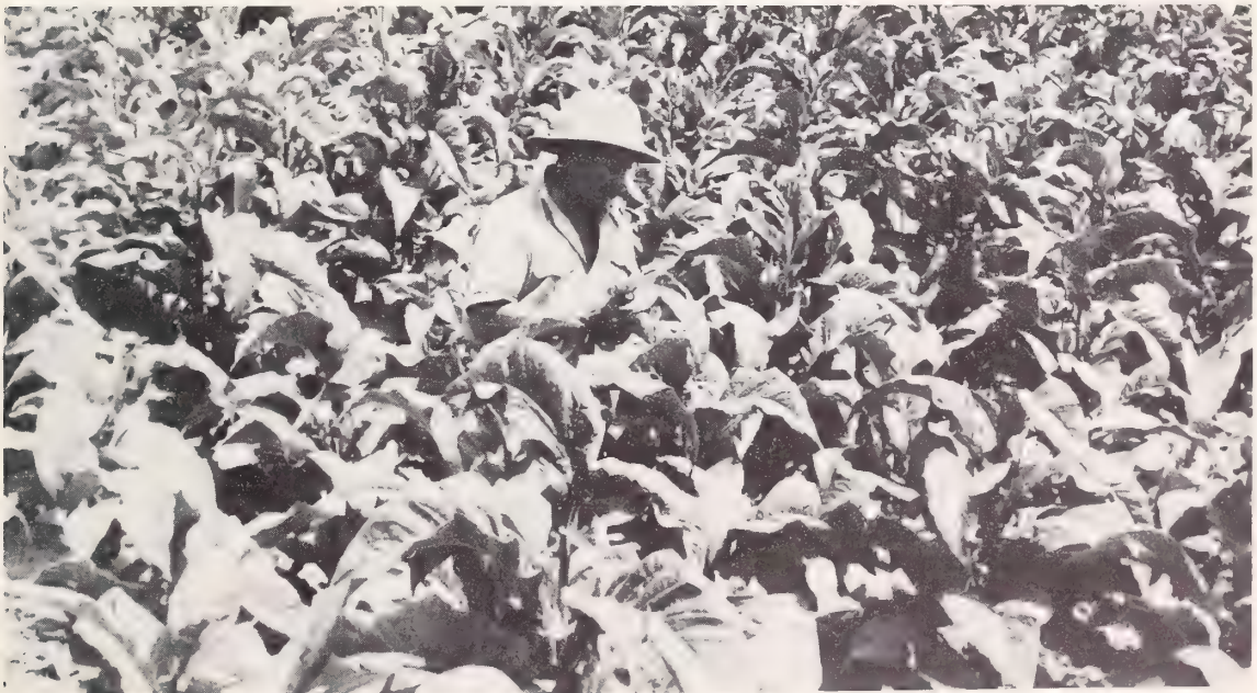
FIGURE 4.--A field in Southern Rhodesia of flue-cured Virginia type leaf tobacco which has been topped and is nearly ready for harvesting. Note selected plants in upper right corner with flower heads covered with paper bags to prevent crossing. The advantage of selecting good seed plants is lost if crossing with other types is allowed to take place.