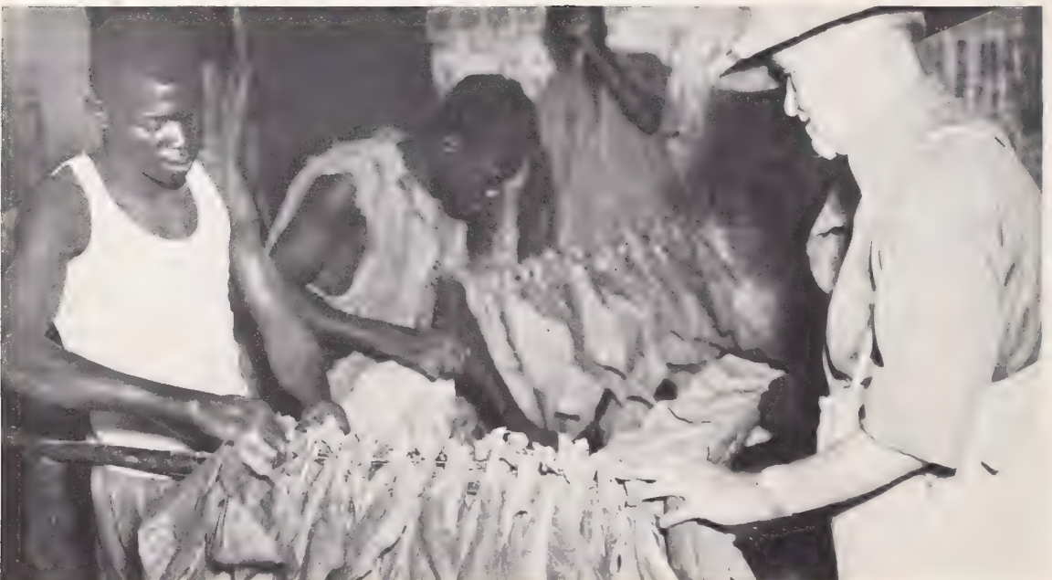
FIGURE 6.--Tying flue-cured Virginia type picked leaves in Southern Rhodesia in preparation for curing. Curing is an essential and important phase in the production of tobacco and is the descriptive term applied to the process by which the newly harvested leaf is first colored and then dried. This type of leaf ordinarily loses about 75 percent of its green weight during the curing process. Most of this loss by far is in water.