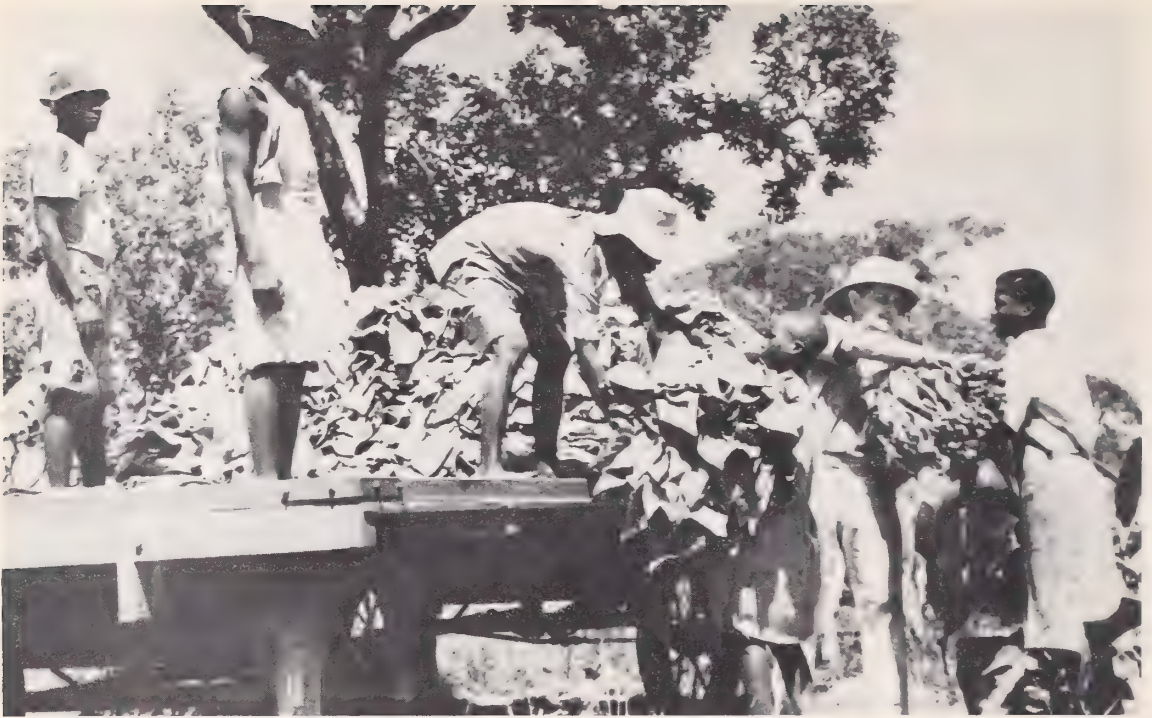
FIGURE 5.--Loading flue-cured Virginia type leaf tobacco which has just been brought in from the field where it has been harvested by the removal of individual leaves from the plant or "priming" rather than by the "stalk cutting" or whole plant method. Usually the number of pickings required to complete the harvest is from three to six, depending on the growth of the plants.