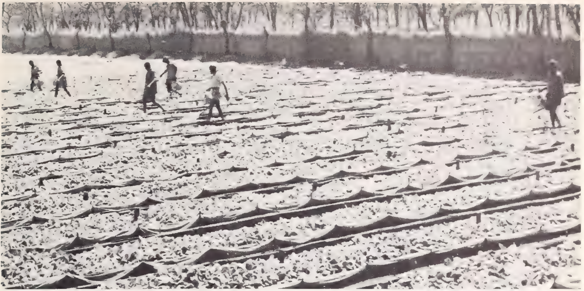
FIGURE 3.--Flue-cured Virginia type seedlings in Southern Rhodesia near Salisbury. The seedlings are being watered after being exposed to the sun to strengthen the young plants. Seeds sown early in the season produce seedlings ready for transplanting in about 60 days. The usual time for sowing flue-cured Virginia type seedbeds in this district is September-October. This enables the grower to produce seedlings for transplanting in November-December. Seedlings are planted when about 6 inches in height. Normally the crop will start to ripen approximately 90 days after date of transplanting.