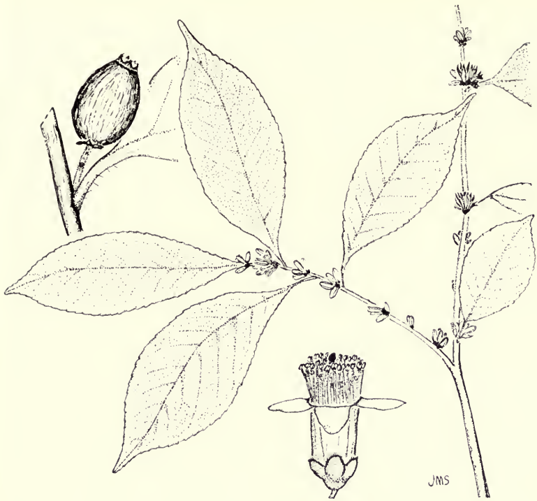
FIG. 2. Symplocos bicolor . A, Branch, \frac{1}{2} natural size. B, Flower, \times 3 . C, Fruit, \times 5 .

I have seen the types of all of the species of Symplocos reported for Guatemala except S. hartwegii and S. limoncillo —the first seems to offer no problem and is quite clear, and although I have a fragment of the type of S. limoncillo it is not adequate to place the species with certainty.