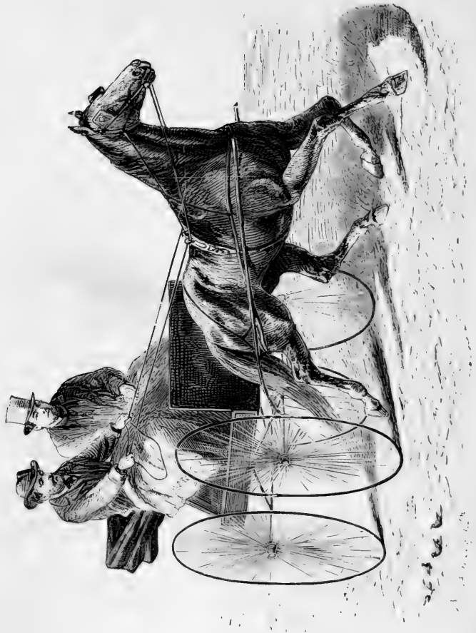
PRESIDENT GRANT DRIVING DEXTER.