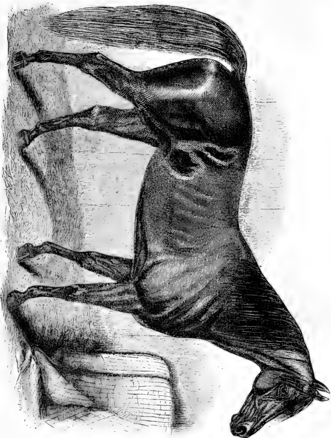
GEORGE M. PATCHEN.

Copied from "Harper's Weekly," by permission of Harper & Bros.