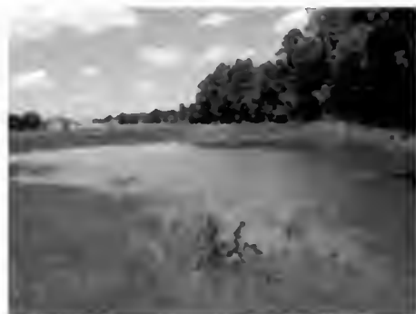
Wetlands project installed 2012