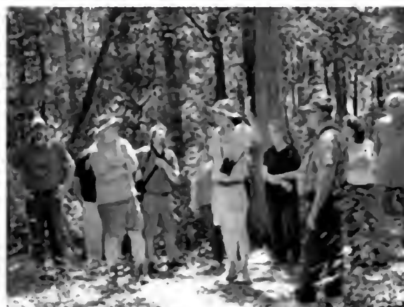
Walking the Lindale Loop Trail