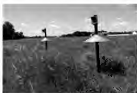
Warm season grass meadow