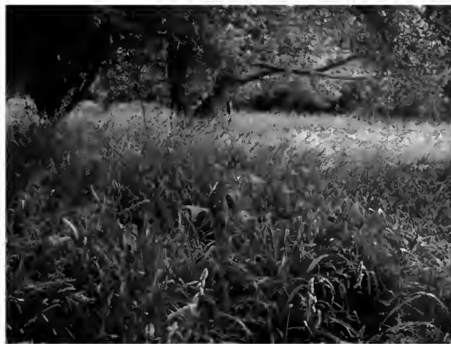
Summer at Newcroft

For more information, visit our website at www.delawarenativeplants.org . Our very informative, up-to-date website has all the contact information for the Society, along with a section on native plants, volunteering, and links to other environmental and plant related organizations.