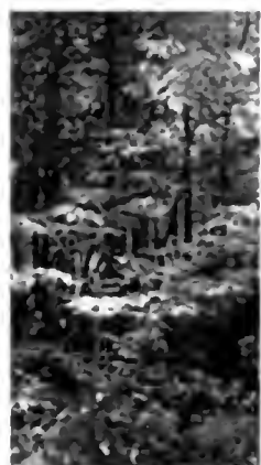
Chestnut tree sapling