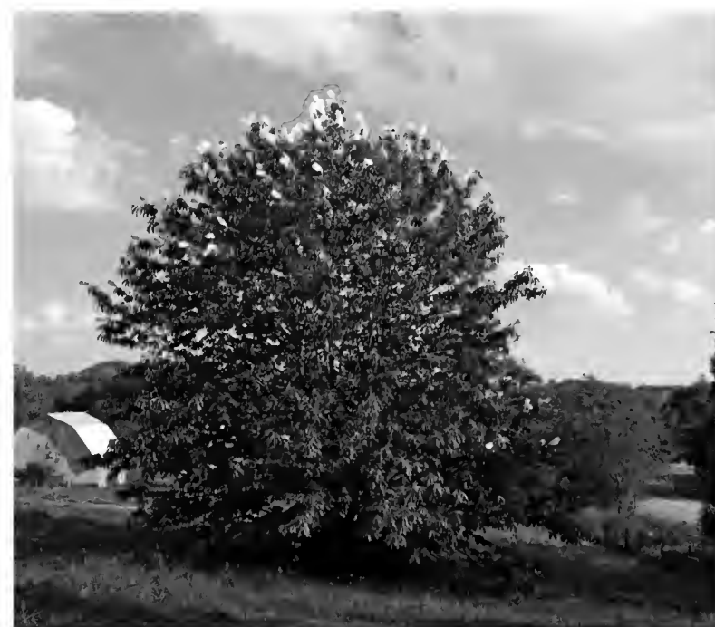
Restoration 1.0 American chestnut hybrid at Meadowview Research Farms, Meadowview, Virginia.

You ask, why are we doing this and what are the implications for our existing program? The list of questions and issues raised by this initiative are many, but let us begin by addressing a few of the most important and obvious issues.