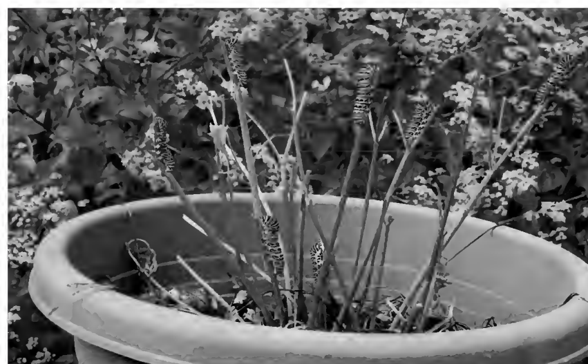
Future Black Swallowtail butterflies enjoying the view of a clump of Conoclinium coelestinum .

Some native plants have adapted to very limited, unusual environments or very harsh climates or exceptional soil conditions. Although some types of plants for these reasons exist only within a very limited range ( endemism ), others can live in diverse areas or by adaptation to different surroundings ( indigenous plant ).