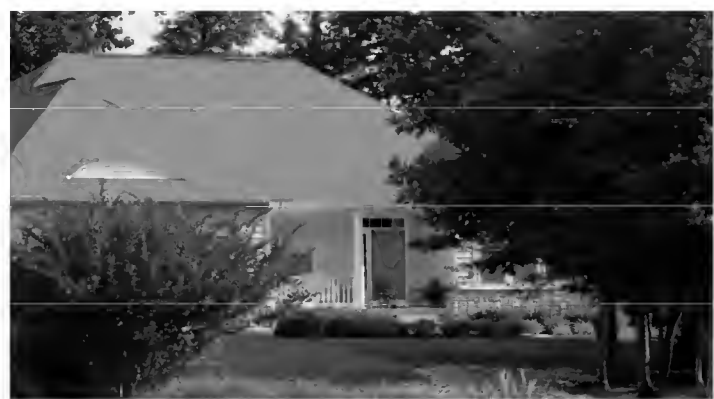
How are the Green Heron fledglings pictured in the top photo and the photo of the suburban home related? They were hatched from a nest located in the native American holly tree on the right, only 40 feet from the front door.