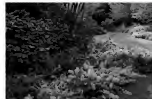
Examples of Living Landscape