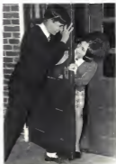
"Dig this Courtesy!"