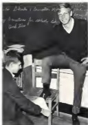
"Well, there are 42 Seniors, so only 41 stars to go!"