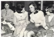
"Guess what I heard this morning!"