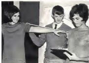
"Right arm - 35 inches" "Left arm - 35 inches"