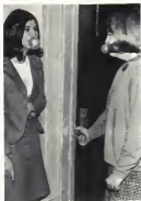
"Showing my way to an F as contact!"