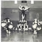
All for Meadow, Stand Up and Cheer!