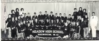
Meadow High School Band