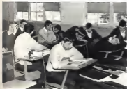
"No, it wasn't Lincoln that crossed the Delaware."