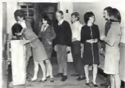
"Good to the last drop"