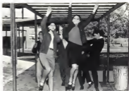
"It's a bird, it's a plane, no -- it's the Seniors!"