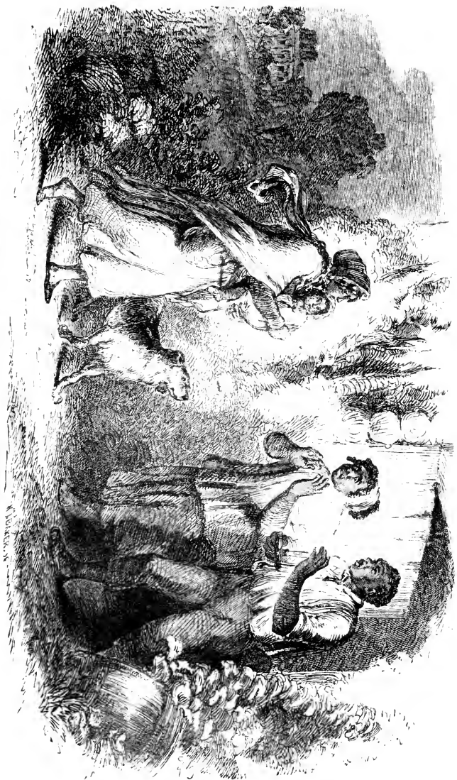
Eliza comes to tell Uncle Tom that he is sold, and that she is running away to save her child.