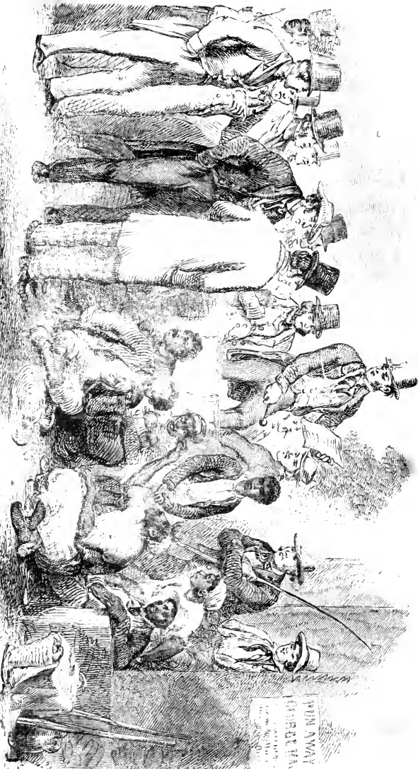
THE AUCTION SALE. Page 174.