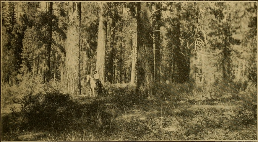
Trinity National Forest, Calif. A forest protected from fire. No burning allowed. Note the young growth coming in.

SOME men say that the Government is all wrong in keeping fire out of the National Forests, that keeping fire out simply means piling up an accumulation of inflammable brush and litter, and that sooner or later a fire is bound to get started in this accumulation and sweep all before it.