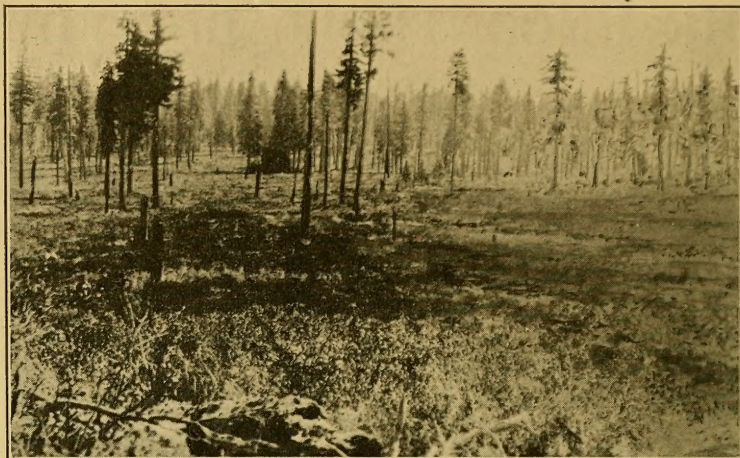
McCloud Flat, Siskiyou County, Calif. Area burned over three times in seven years. Notice scarcity of timber and density of brush.

brush and tree seedlings, for the same reason that the grain farmer distinguishes between weeds and wheat.