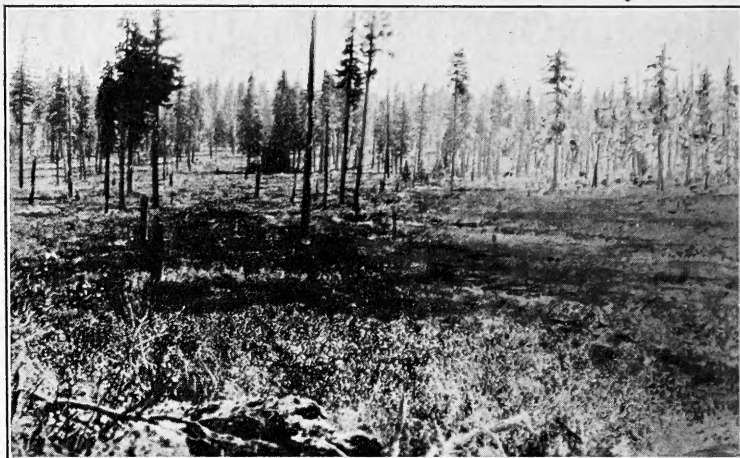
McCloud Flat, Siskiyou County, Calif. Area burned over three times in seven years. Notice scarcity of timber and density of brush.

brush and tree seedlings, for the same reason that the grain farmer distinguishes between weeds and wheat.