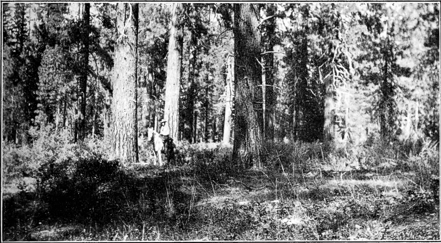
Trinity National Forest, Calif. A forest protected from fire. No burning allowed. Note the young growth coming in.

SOME men say that the Government is all wrong in keeping fire out of the National Forests, that keeping fire out simply means piling up an accumulation of inflammable brush and litter, and that sooner or later a fire is bound to get started in this accumulation and sweep all before it.