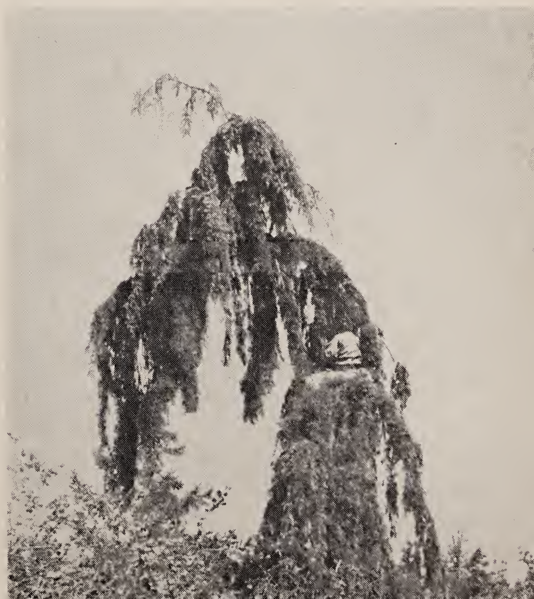
A "weeping" form of Douglas Fir Fig. 12