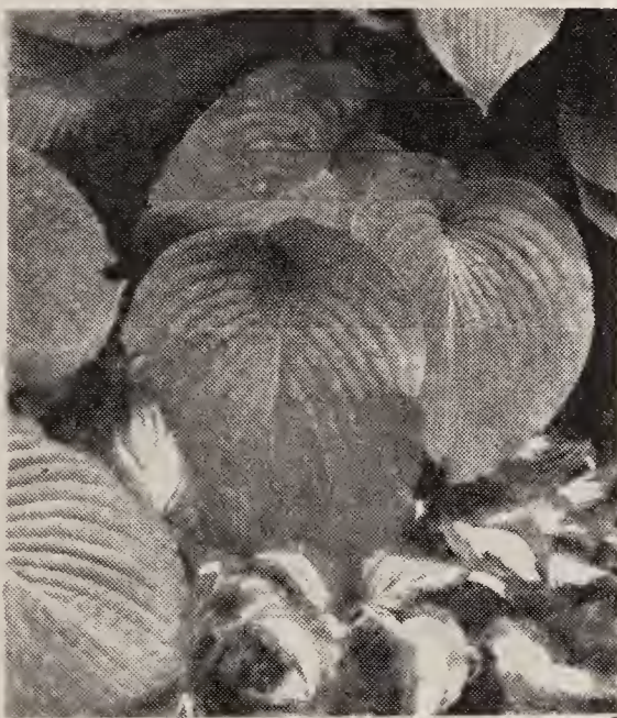
George Schenk, Design Don Normark, Photos

THE 1500 PLANTS IN OUR 1969 PRICE LIST (25c) COMPRISE SPECIES FOR EVERY LANDSCAPE USE, FOR ALL N.A. CLIMATES. BUSINESS BY MAIL ORDER ONLY.