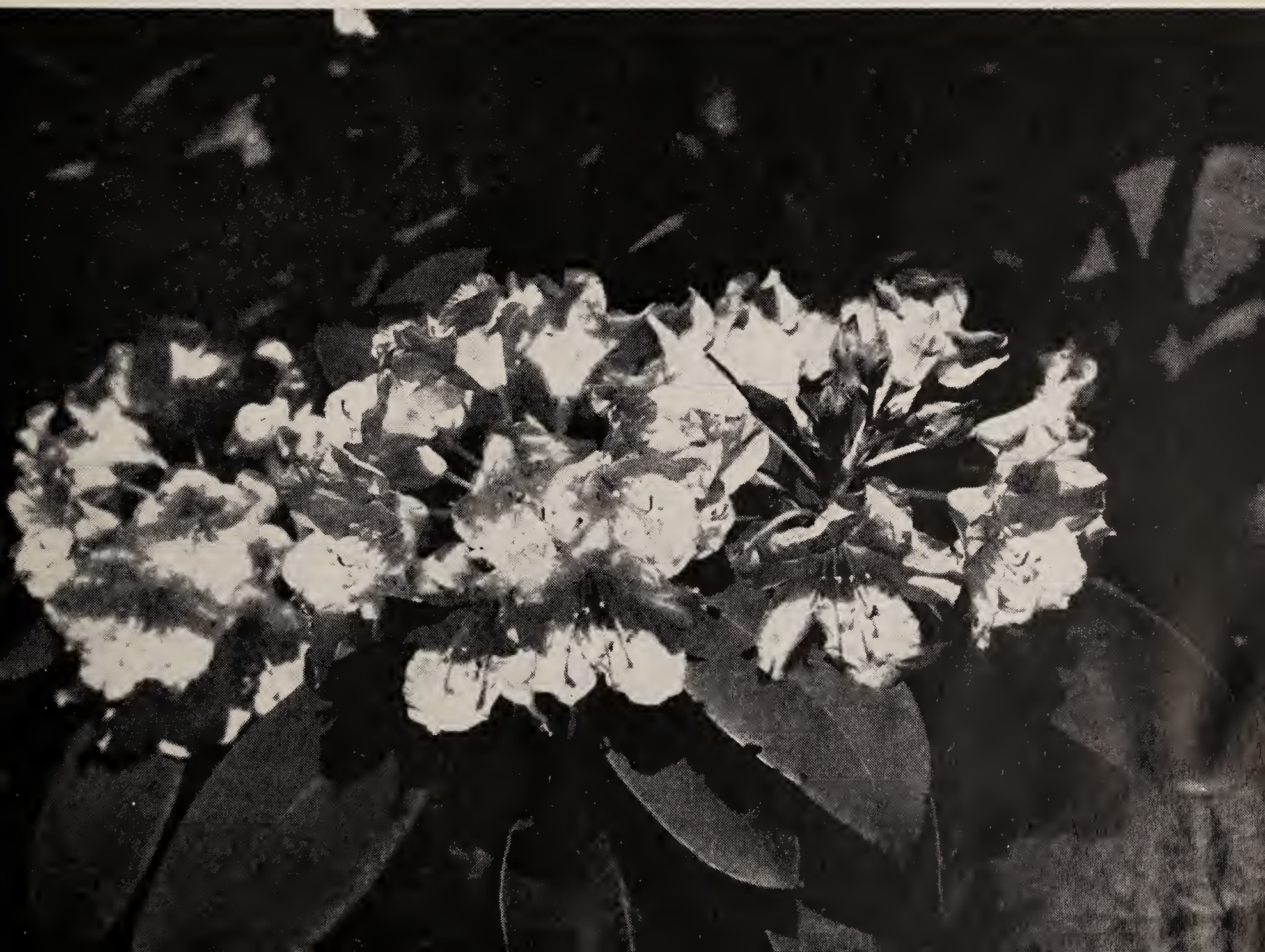
Rhododendron macrophyllum Fig. 3