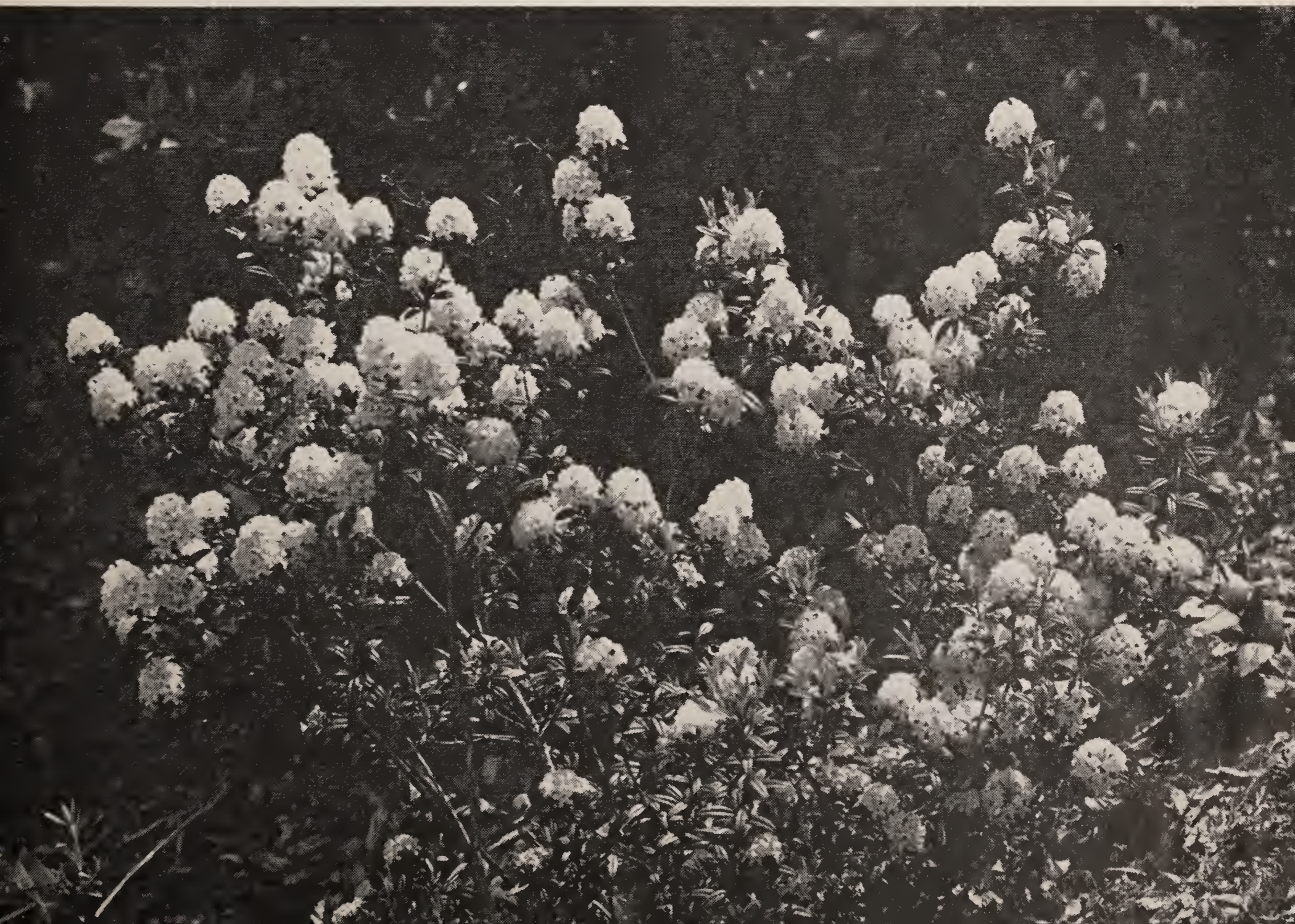
Fig. 2