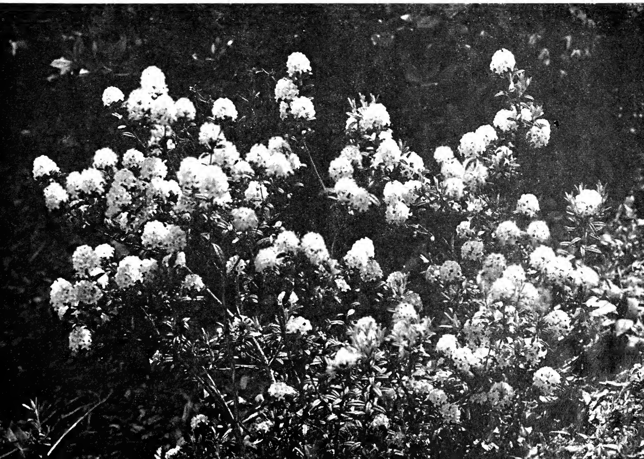
Fig. 2