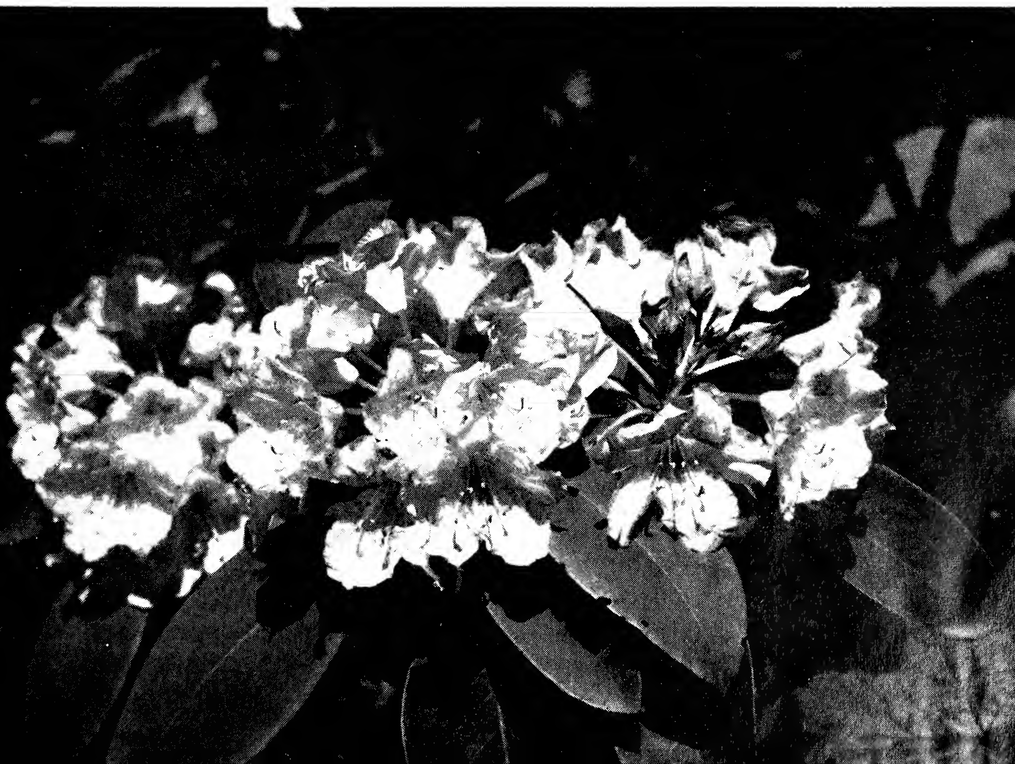
Rhododendron macrophyllum Fig. 3