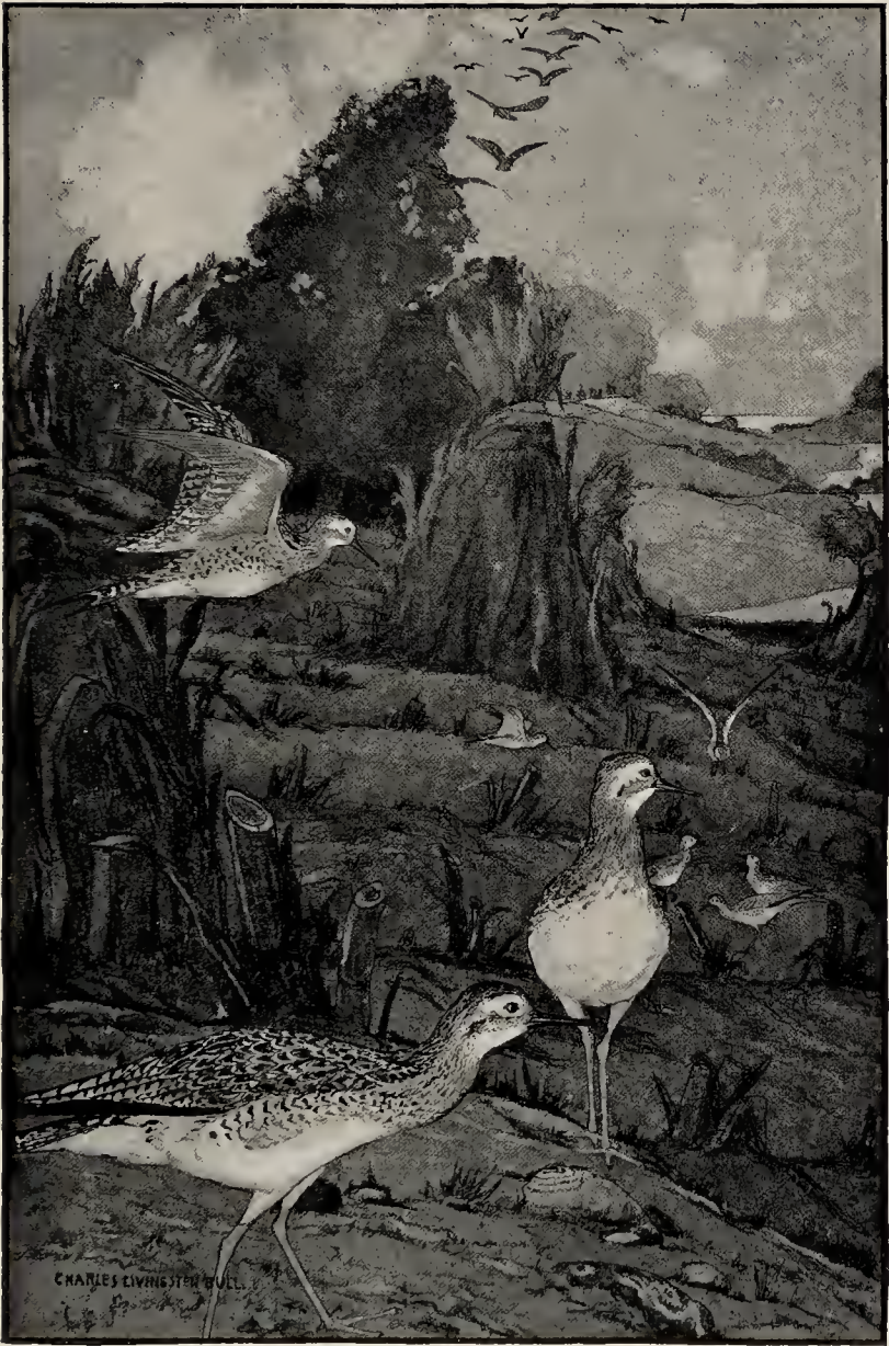
THE GAME-BIRD OF THE UNIVERSE (Upland Plover)