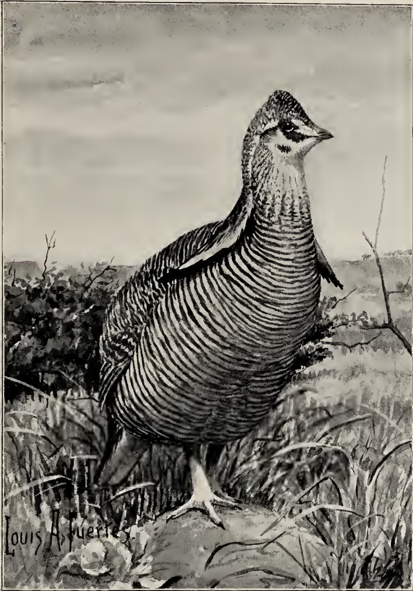
THE PRAIRIE CHICKEN (Pinnated Grouse)