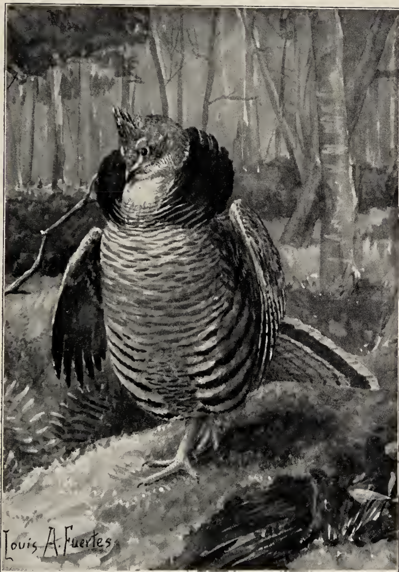
THE RUFFED GROUSE STRUTTING