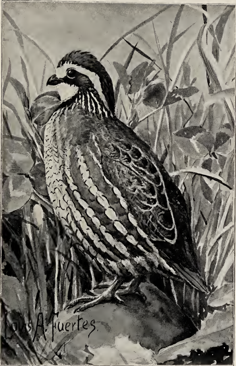
THE NATIONAL GAME-BIRD