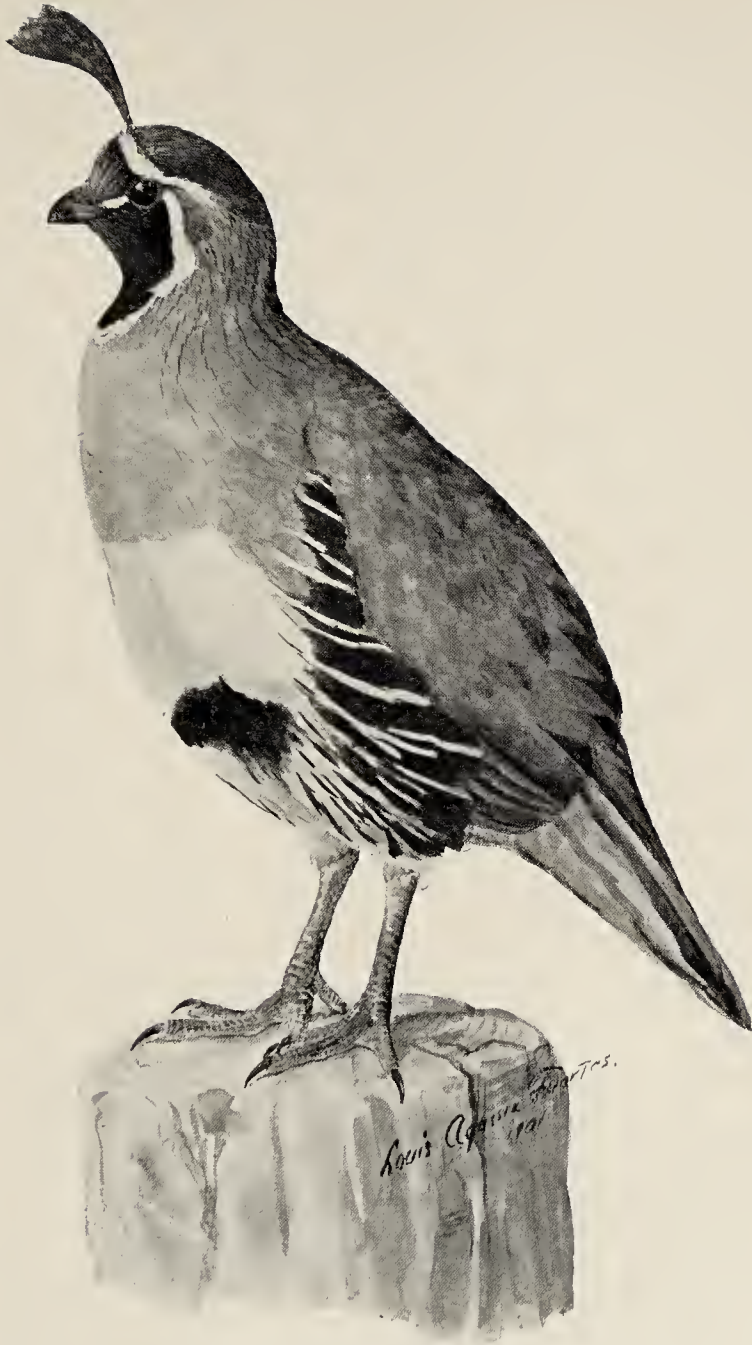
A DESERT RUNNER (Gambel's Partridge)