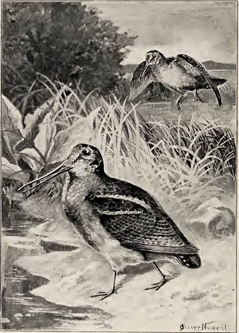
A WOODLAND HERMIT (The Woodcock)