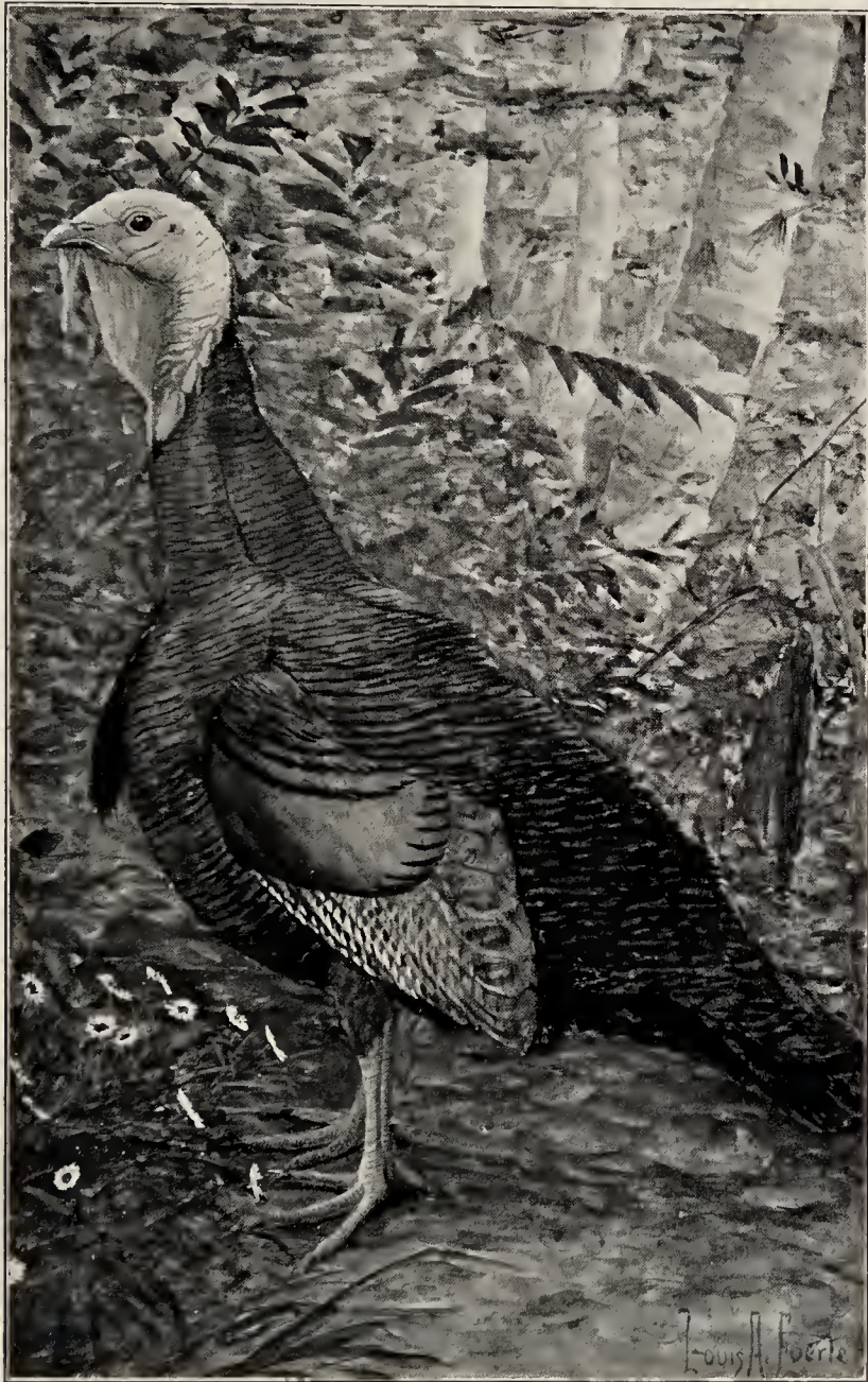
THE KING OF WILD BIRDS