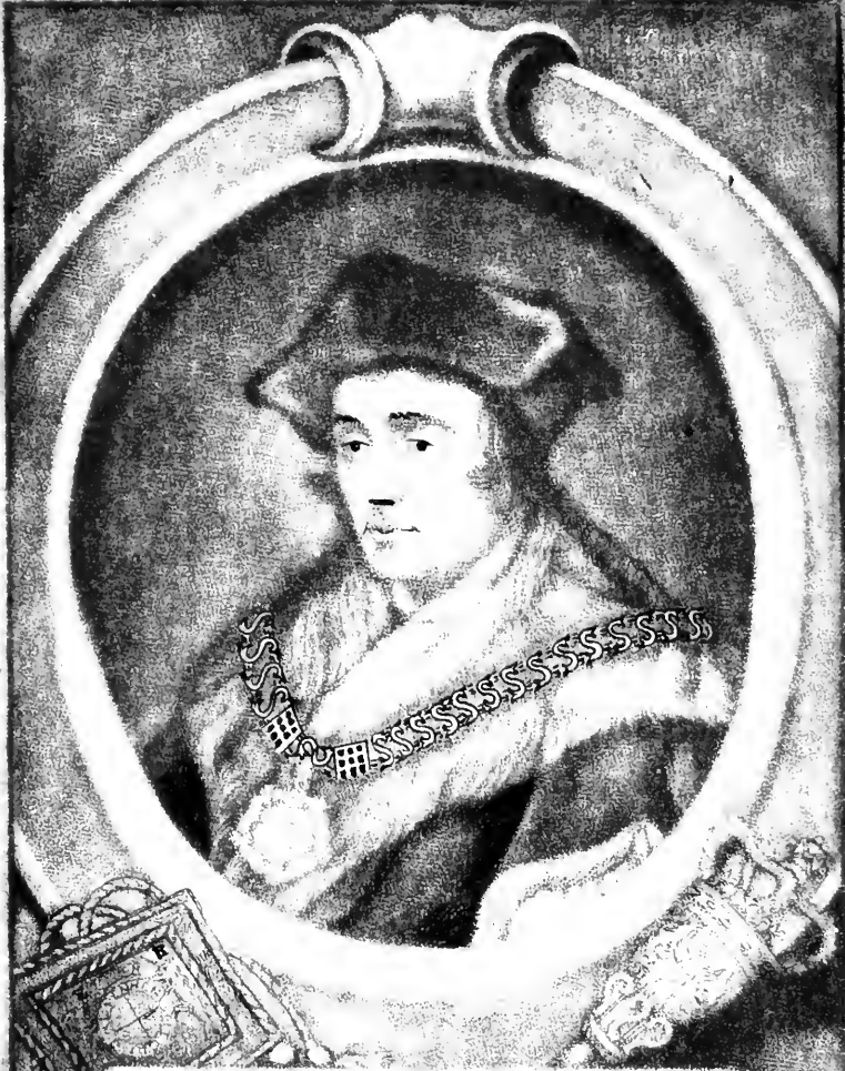
S r THOMAS MORE K. nt Lord Chancellor of England.