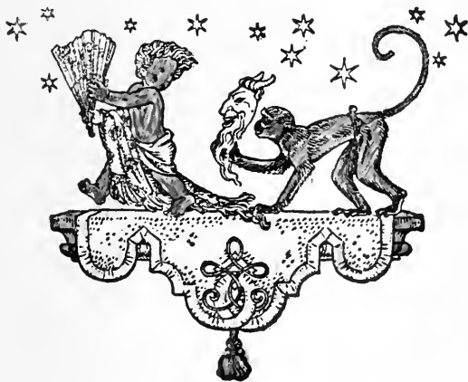
Painted in Great Babylon

P. 189. Carathis on the back of an afrit. The expedition of the afrit in fetching Carathis is characteristic of this order of dives. We read in the Koran that another of the fraternity offered to bring the Queen of Saba's throne to Solomon before he could rise from his place, ch. 27.