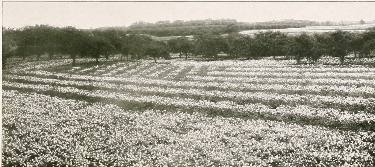
MAMMOTH AMERICAN FLAG OF GROWING ASTERS ON OUR FARM AT OGDEN, N. Y.

JAMES VICK'S SONS — ROCHESTER — THE FLOWER CITY