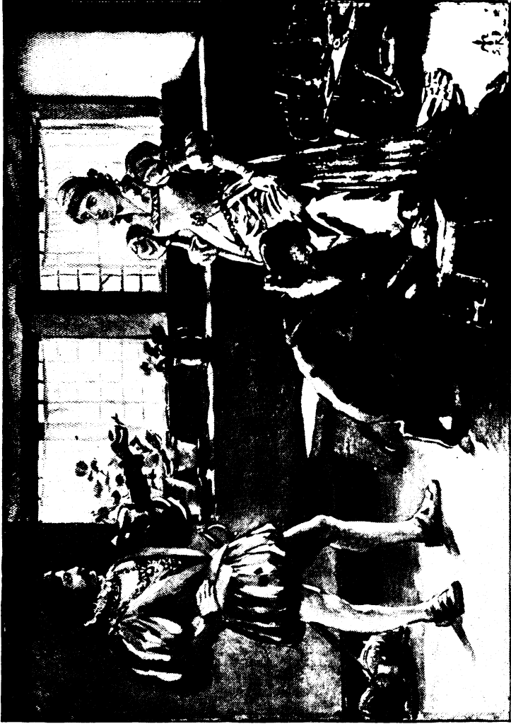
"HE SAW HER EYES BRIGHTER THAN THE STARS."