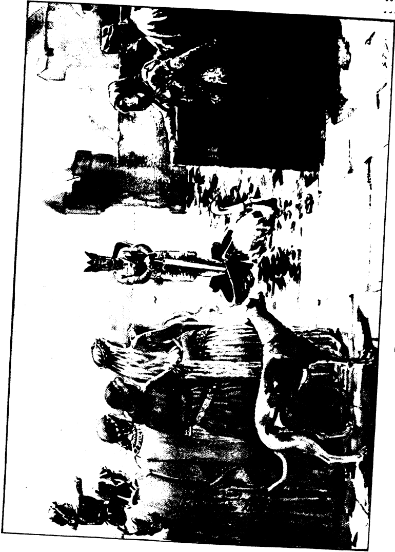
"THE KNIGHT OF HER DREAM."