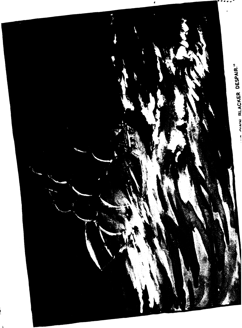
... AGAIN BLACKER DESPAIR."