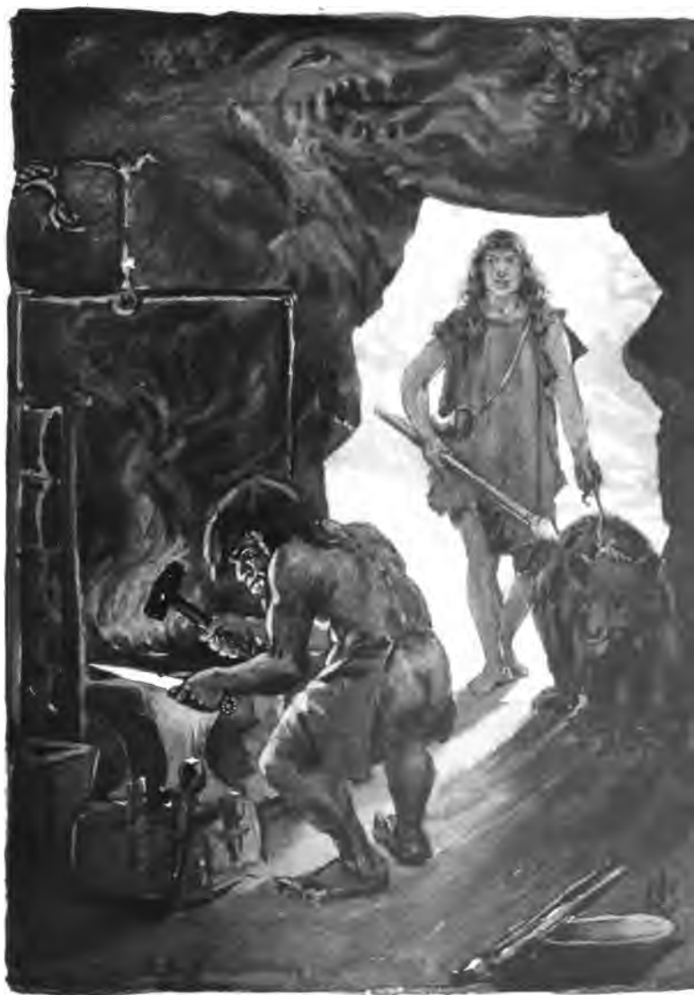
"THE SUNLIGHT FOLLOWS HIM STRAIGHT INTO THE CAVE."