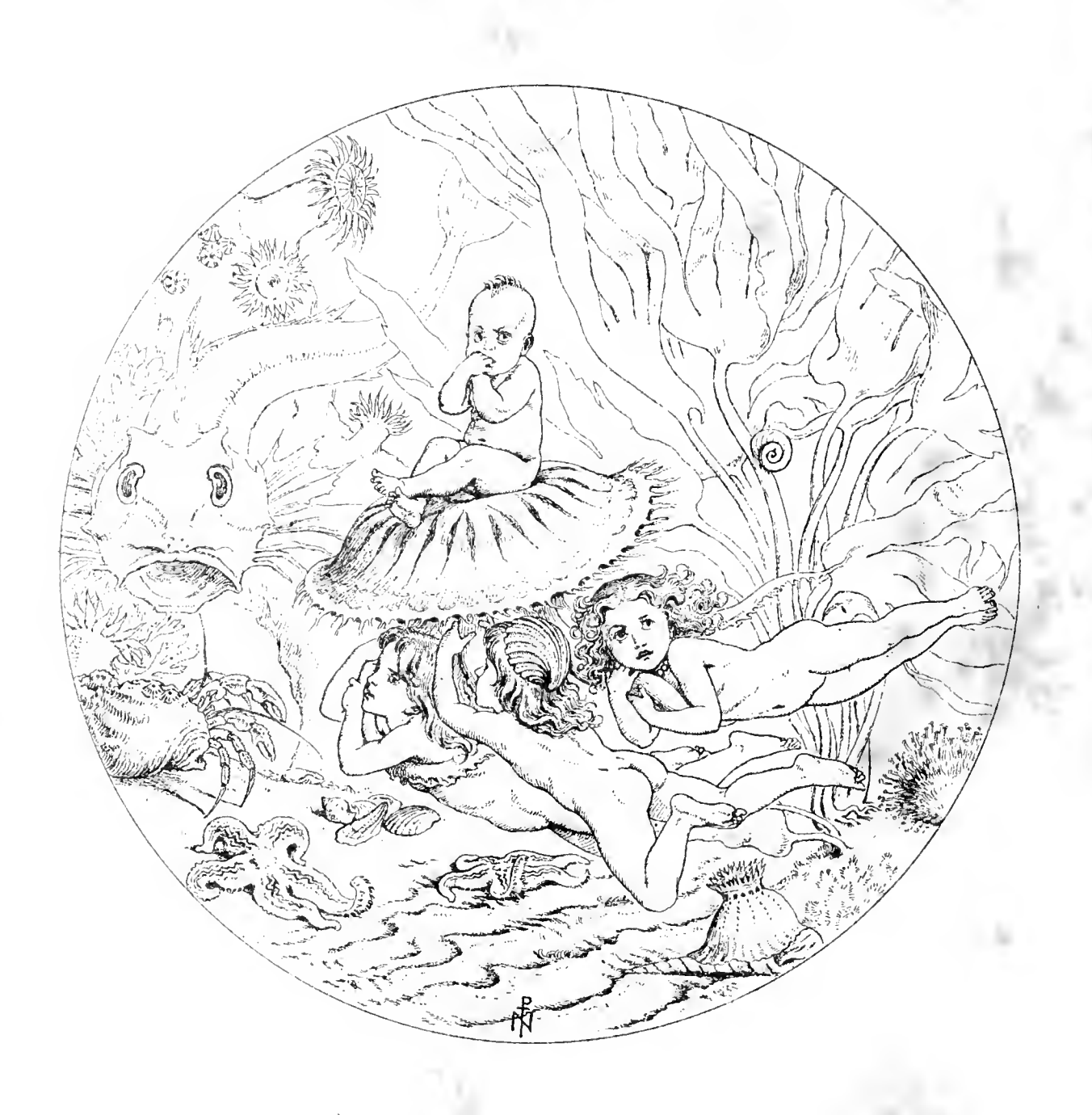
WATER BABIES __ page 145