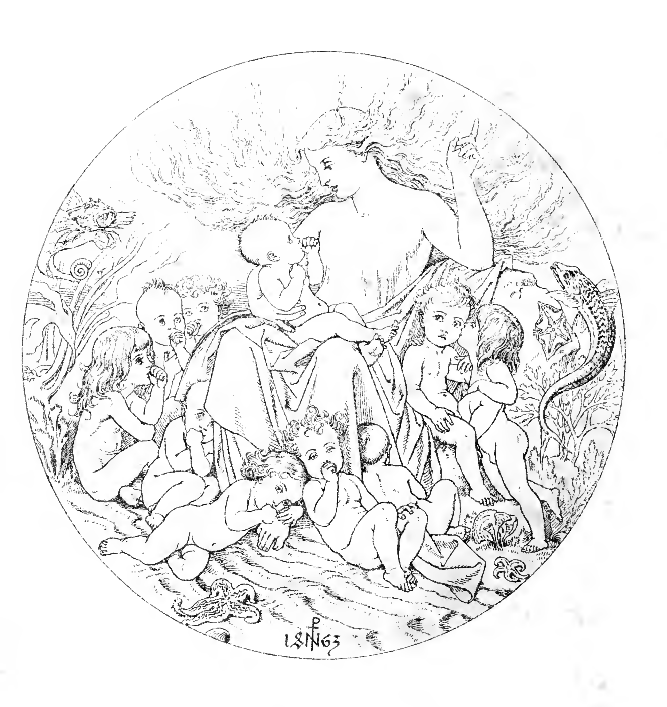
WATER BABIES . From whose