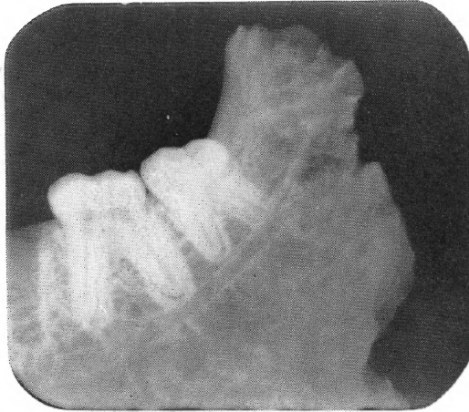
FIG. 4. Xenothrix mcgregori , type mandible, A.M.N.H. No. 148198, X-ray photograph of posterior portion. Ca. \times 2 .

The molars are quite large relative to the jaw, though the jaw itself is robust. Such relatively large teeth are in living cebids characteristic of Alouatta or Brachyteles and are in strong con-