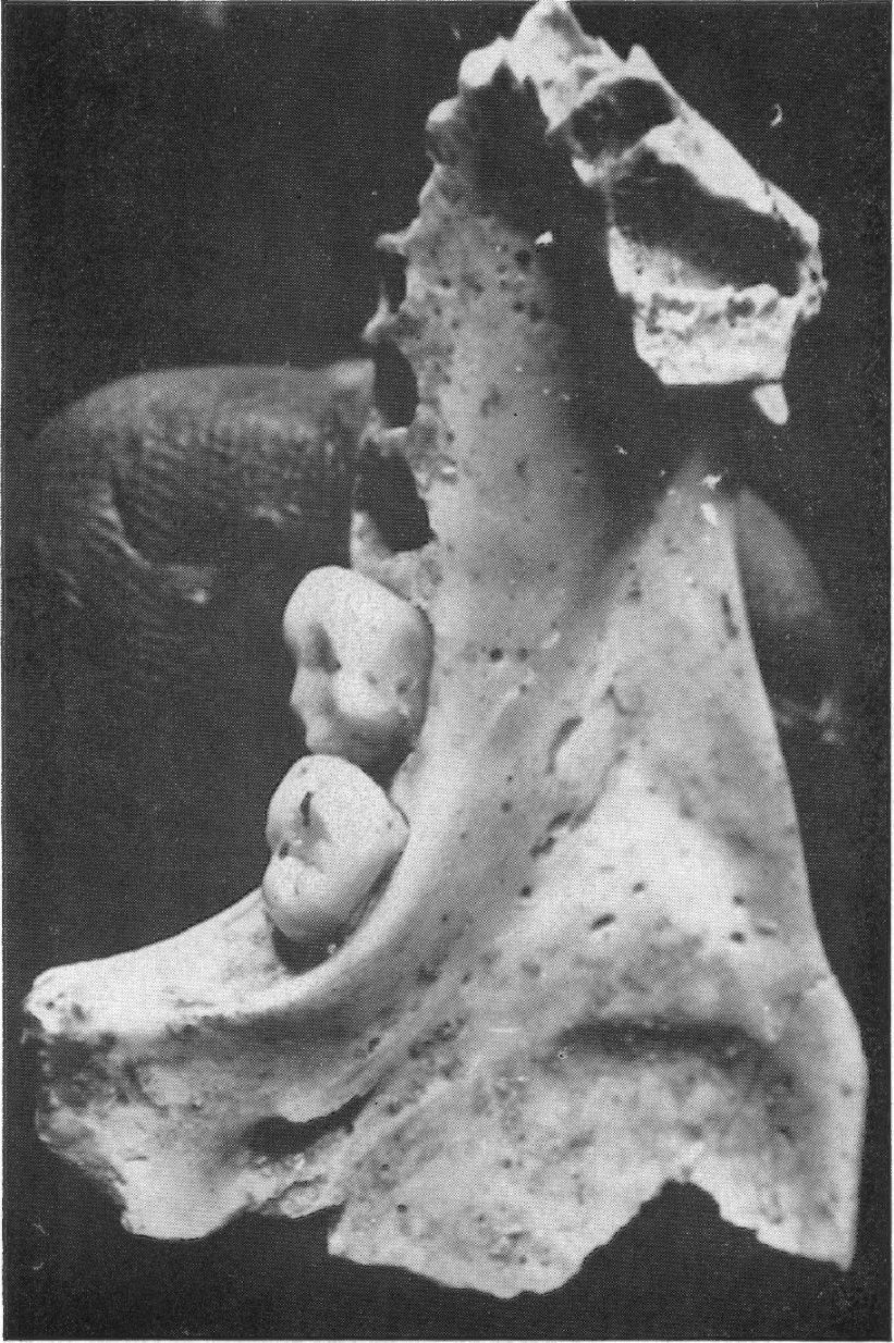
FIG. 2. Xenothrix mcgregori , type mandible, A.M.N.H. No. 148198, internal view. Ca. \times 3\frac{1}{2} .