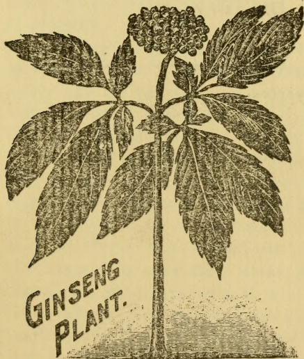
Ginseng plant with cluster of berries.

AN ACCOUNT OF THE HISTORY AND CULTIVATION OF GINSENG