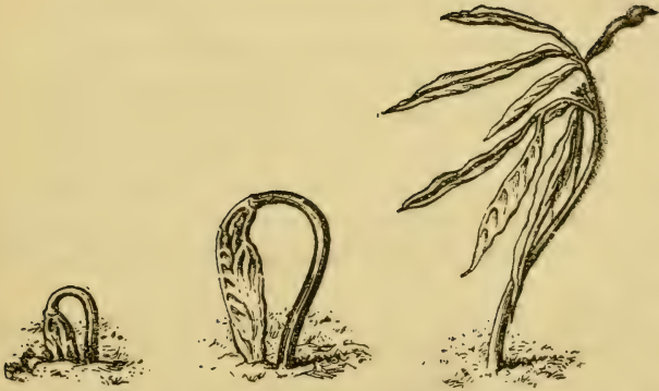
Young Ginseng plants breaking through the ground.