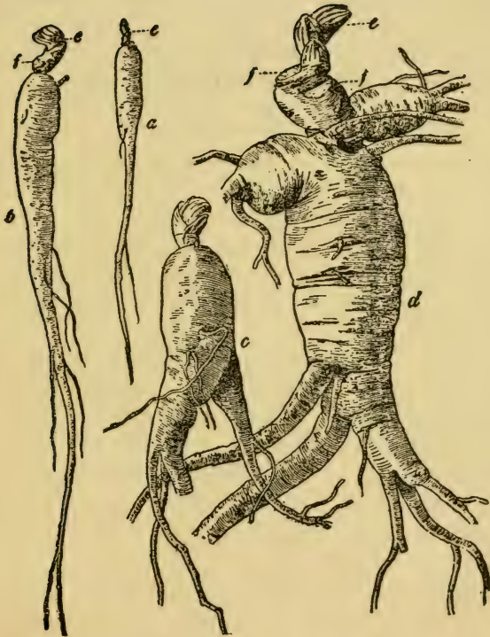
a. — a. yearling plant. f. — b. 2 year old plant. c. 3 year old plant. d. 4 year old plant ready for market.