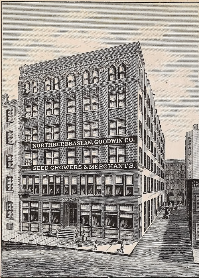
OUR CHICAGO WAREHOUSE.

CHOICE SEEDS AT FAIR PRICES IS THE FOUNDATION OF OUR SUCCESS.