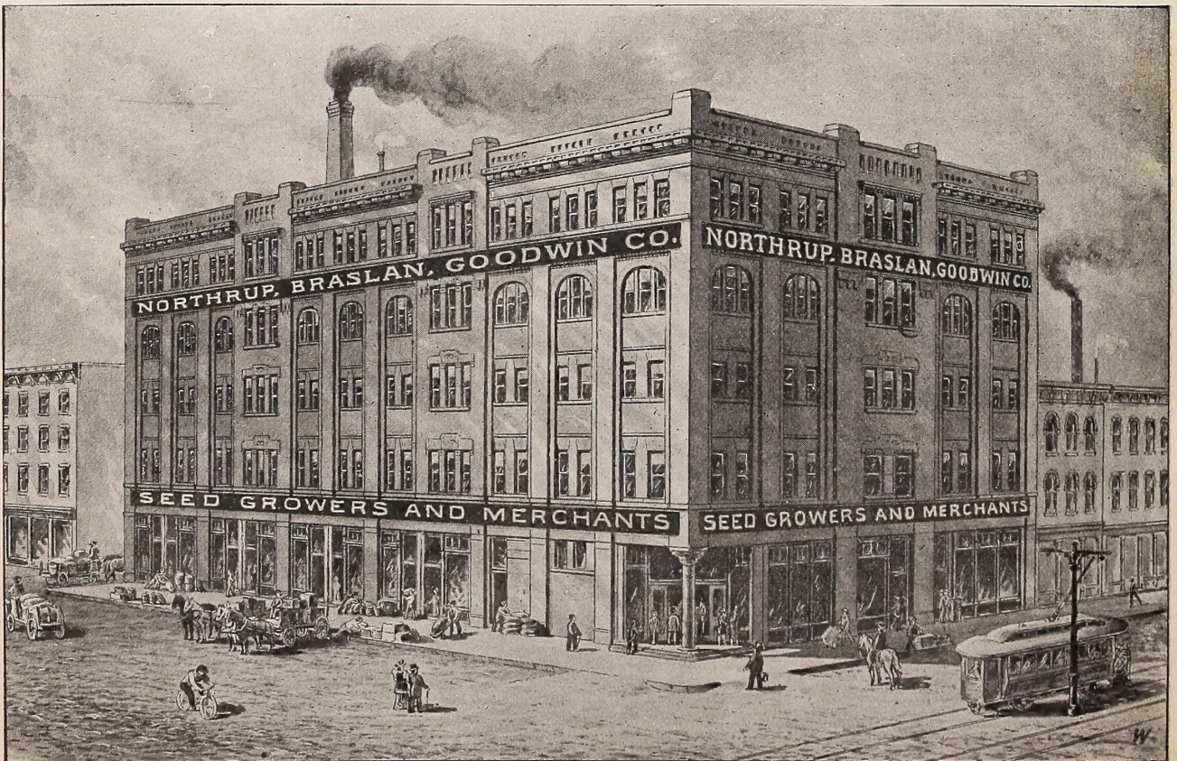
OUR MINNEAPOLIS WAREHOUSE.