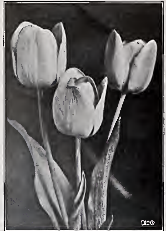
Darwin Tulip, Clara Butt