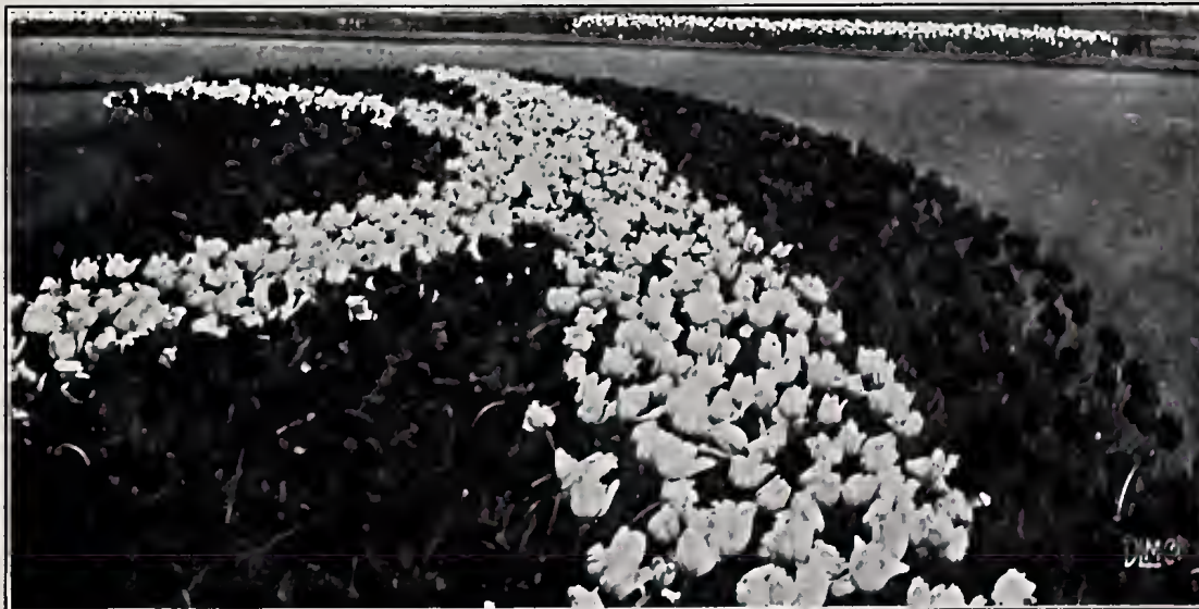
Planting of Tulips

Parisian Yellow. Rich lemon yellow. 25c. per doz., $1.25 per 100, $10.00 per 1000.