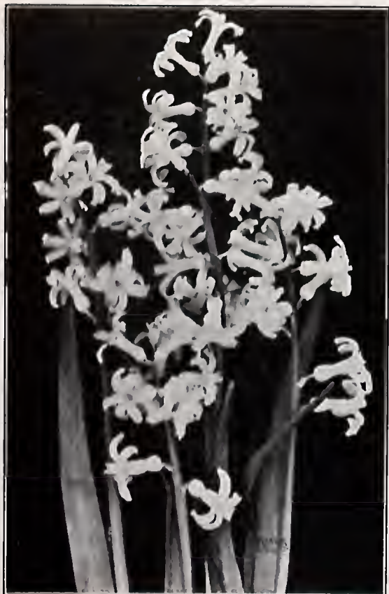
White Roman Hyacinths