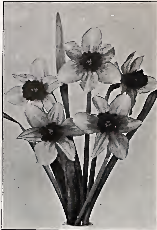
Narcissus, Sir Watkin