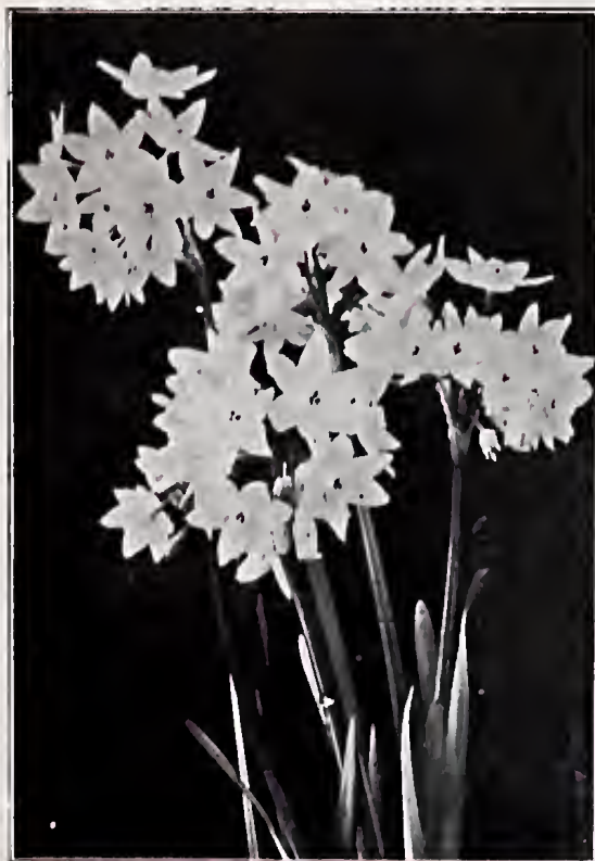
Narcissus, Paper White Grandiflora