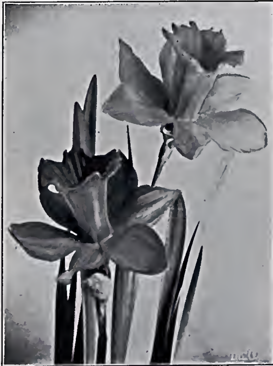
Narcissus Golden Spur

* Emperor. Large yellow trumpet, immense flower of great substance; a fine variety. Double nose bulbs, 25c. per doz., $1.40 per 100, $12.00 per 1000. First size bulbs, 20c. per doz., $1.10 per 100, $10.00 per 1000.