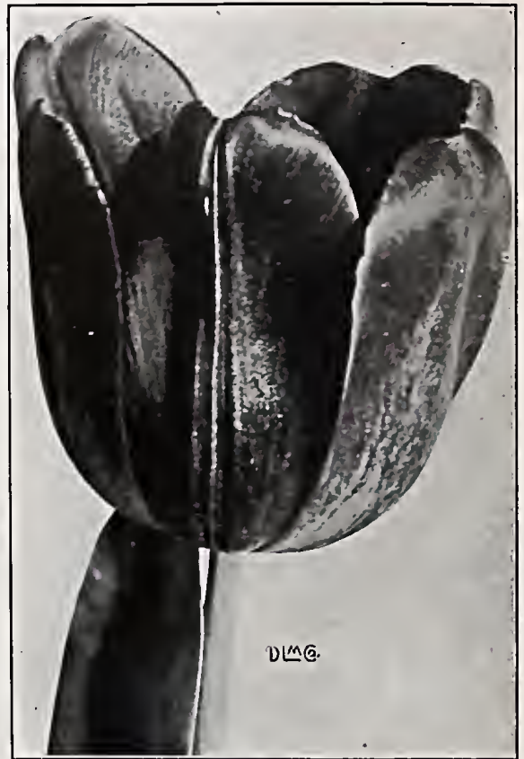
Tulip, Pink Beauty