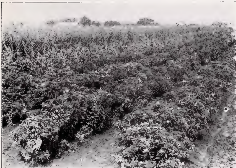
SHRUBS, TWO YEAR. SPIREA A. W. IN FOREGROUND