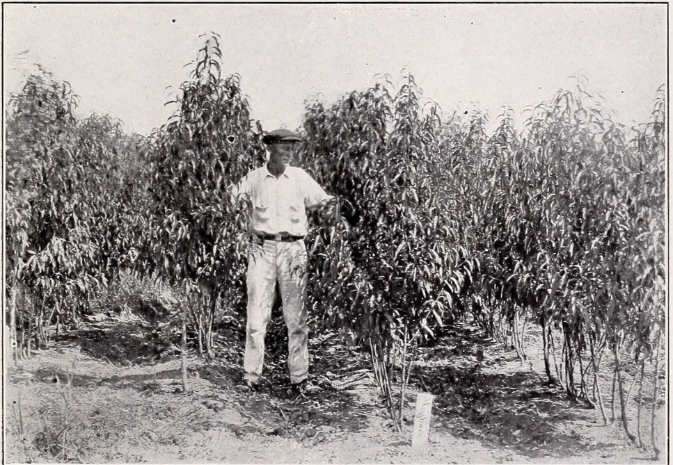
PEACH, ONE YEAR