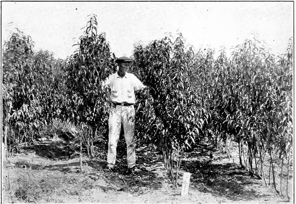
PEACH, ONE YEAR