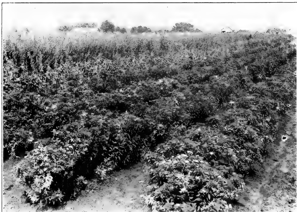
SHRUBS, TWO YEAR. SPIREA A. W. IN FOREGROUND