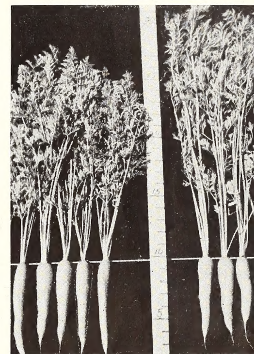
Left, CARROT IMPERIDA Right, CARROT IMPERATOR