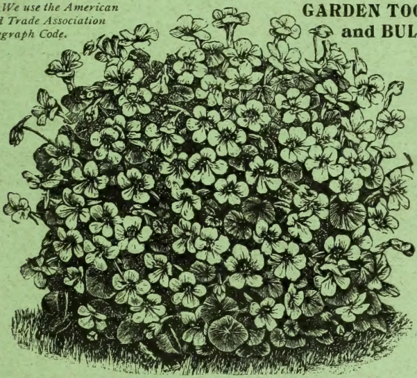
NEW LILIPUT NASTURTIUM, Per Lb., $6.00.