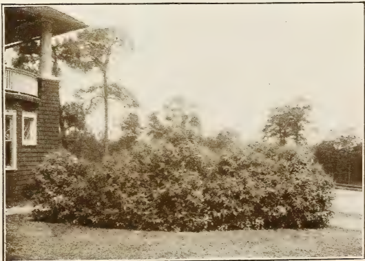
CLUMP OF LIGUSTRUM EXCELSUM SUPERBUM