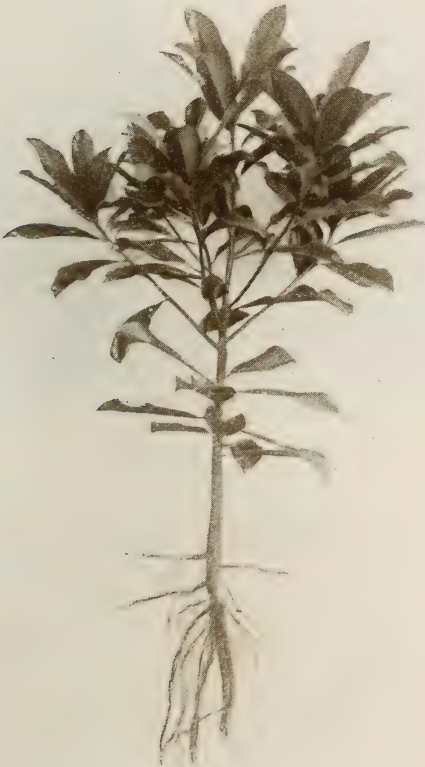
A FOUR FOOT TRANSPLANTED MAGNOLIA GRANDIFLORA