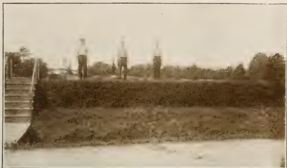
HEDGE OF CITRUS TRIFOLIATA