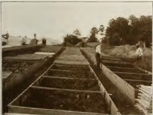
AZALEA INDICA IN COLD FRAMES

Indica, Imported. Best named varieties; grafted with trained heads; very stocky; well set with buds; nice bushy crowns. 12 to 14 in. diameter of crown..... $7.00 10 to 12 in. diameter of crown..... 6.00