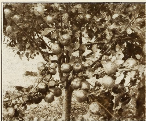
SIX YEAR KANSAS QUEEN APPLE