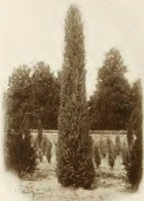
JUNIPERUS COMMUNIS GLAUCA, ORIGINAL PLANT AT FRUITLAND