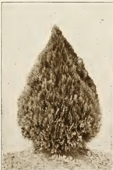
BIOTA AUREA NANA

Erect growth; foliage intense gold, some of its branches having a solid metallic tint and others suffused with green. A beautiful variety; very scarce, and difficult to propagate. Perfectly hardy at New York.