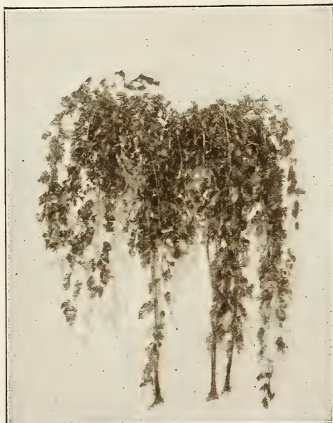
TEAS' WEEPING MULBERRY.