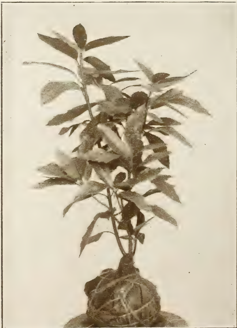
AUCUBA JAPONICA AUREA MACULATA