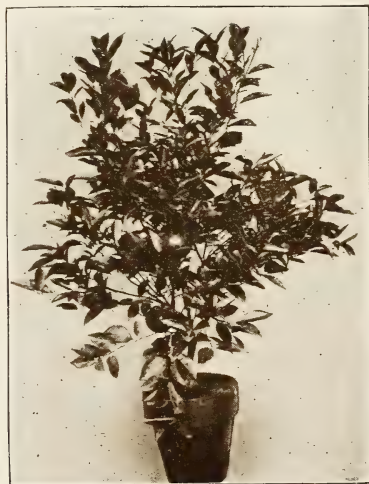
GRAFTED ORANGE, THREE YEARS OLD.