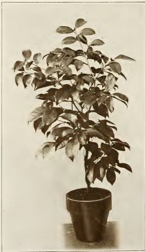
POT GROWN CAMELLIA JAPONICA

Imported. Can supply in November a large quantity of this old favorite plant. The plants will be well branched and shapely. Our collection contains about fifteen