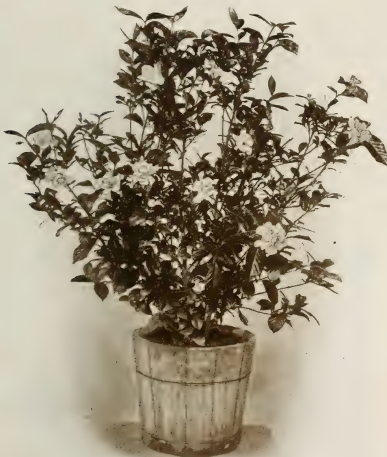
CAPE JASIMINE (GARDENIA FLORIDA)