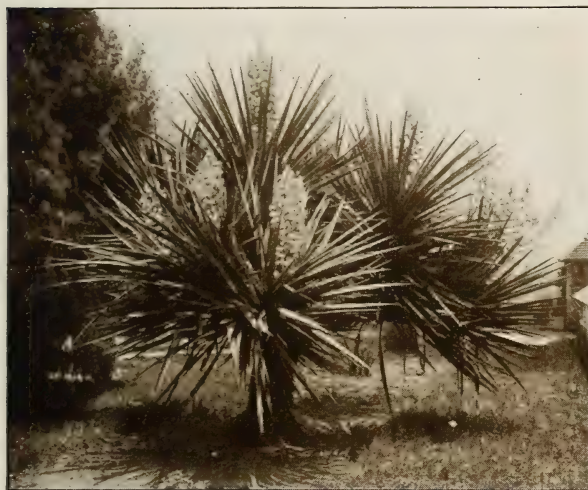
YUCCA TRECULEANA, AT FRUITLAND