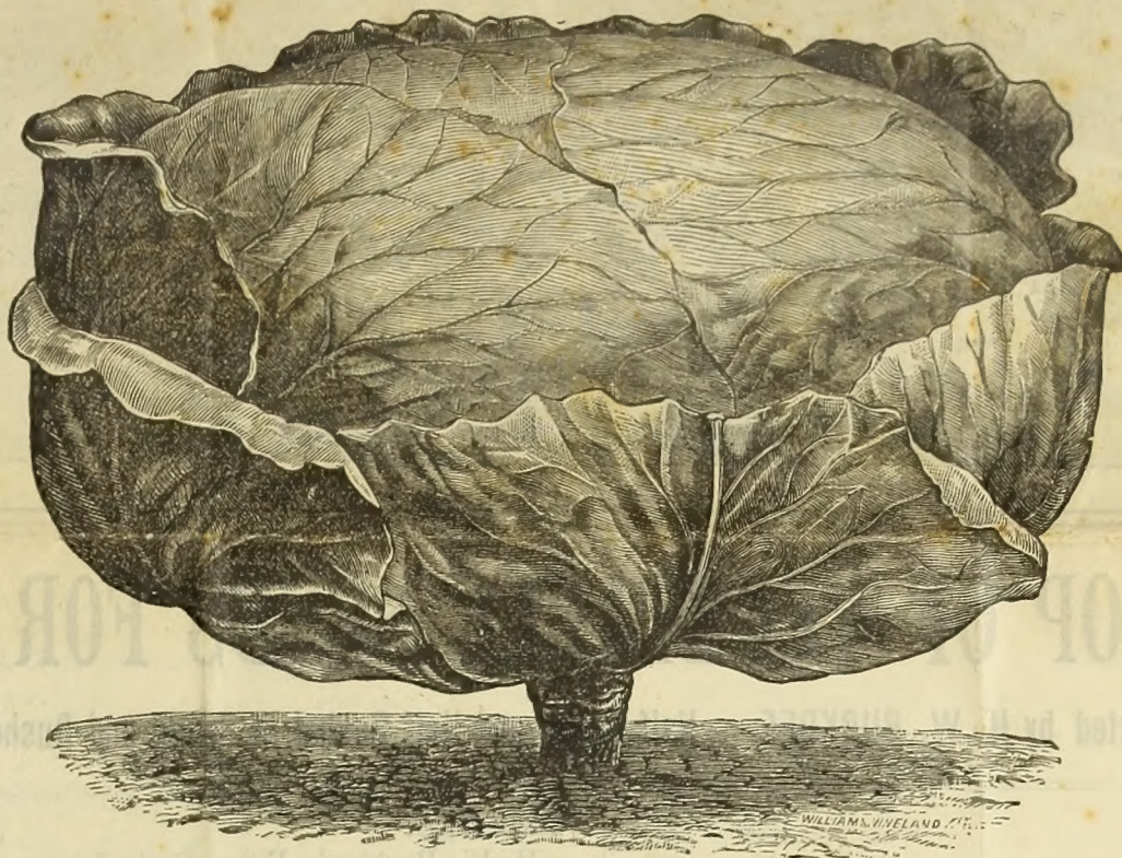
CABBAGE, BUCKBEE'S MAMMOTH LATE FLAT DUTCH.