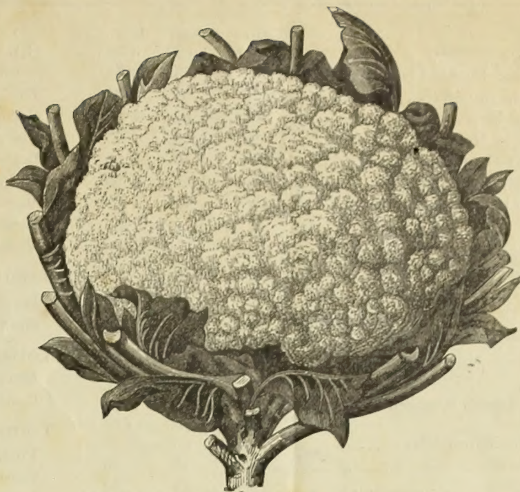
CAULIFLOWER—Extra Early Favorite.

NO ORDER IS COMPLETE WITHOUT H. W. BUCKBEE'S EARLY NEW QUEEN CABBAGE.