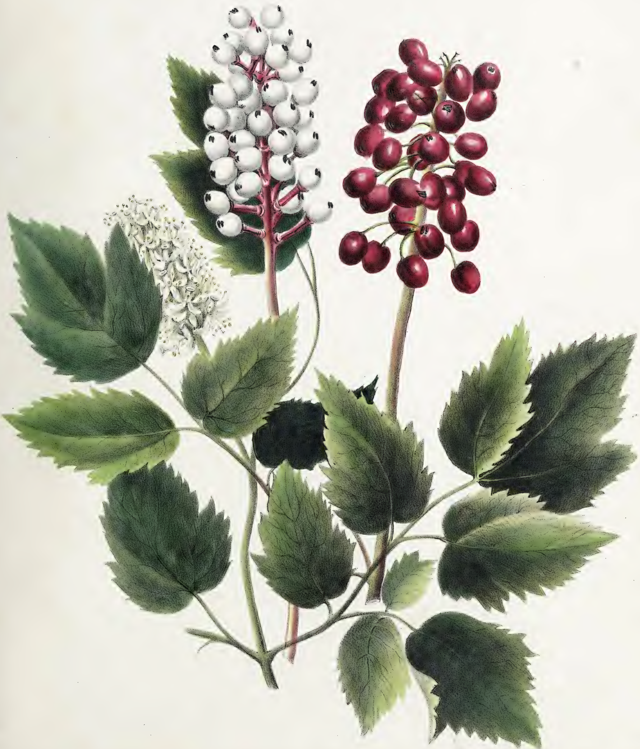
Actæa Alba & Rubra.