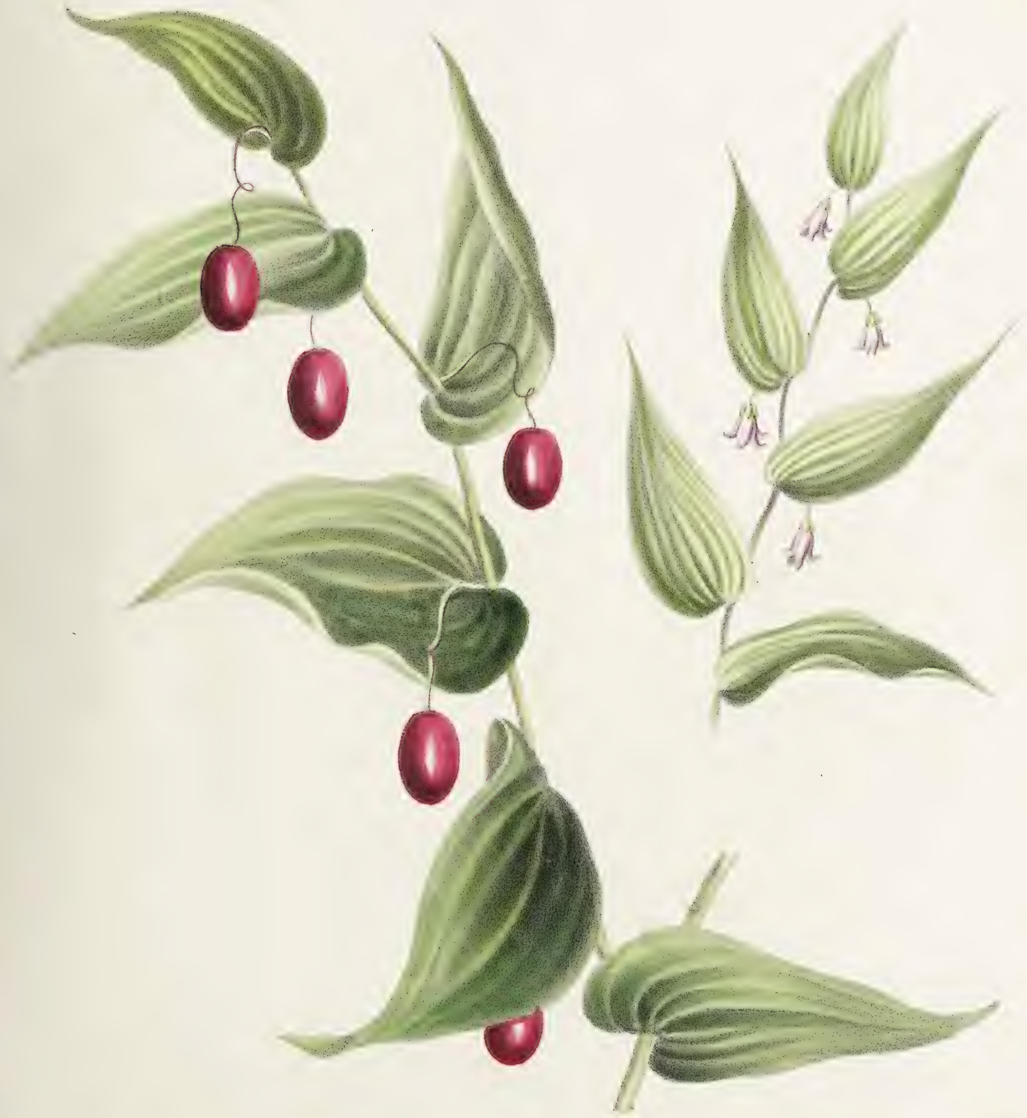
POLYGONATUM PUBESCENS. SMALLER SOLOMON'S ISLANDS.