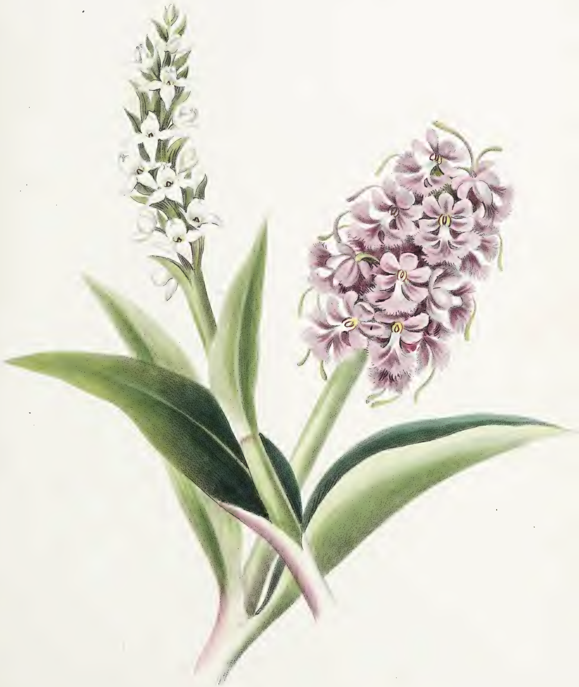
Platanthera fimbriata. LARGE PURPLE FRINGED ORCHIS