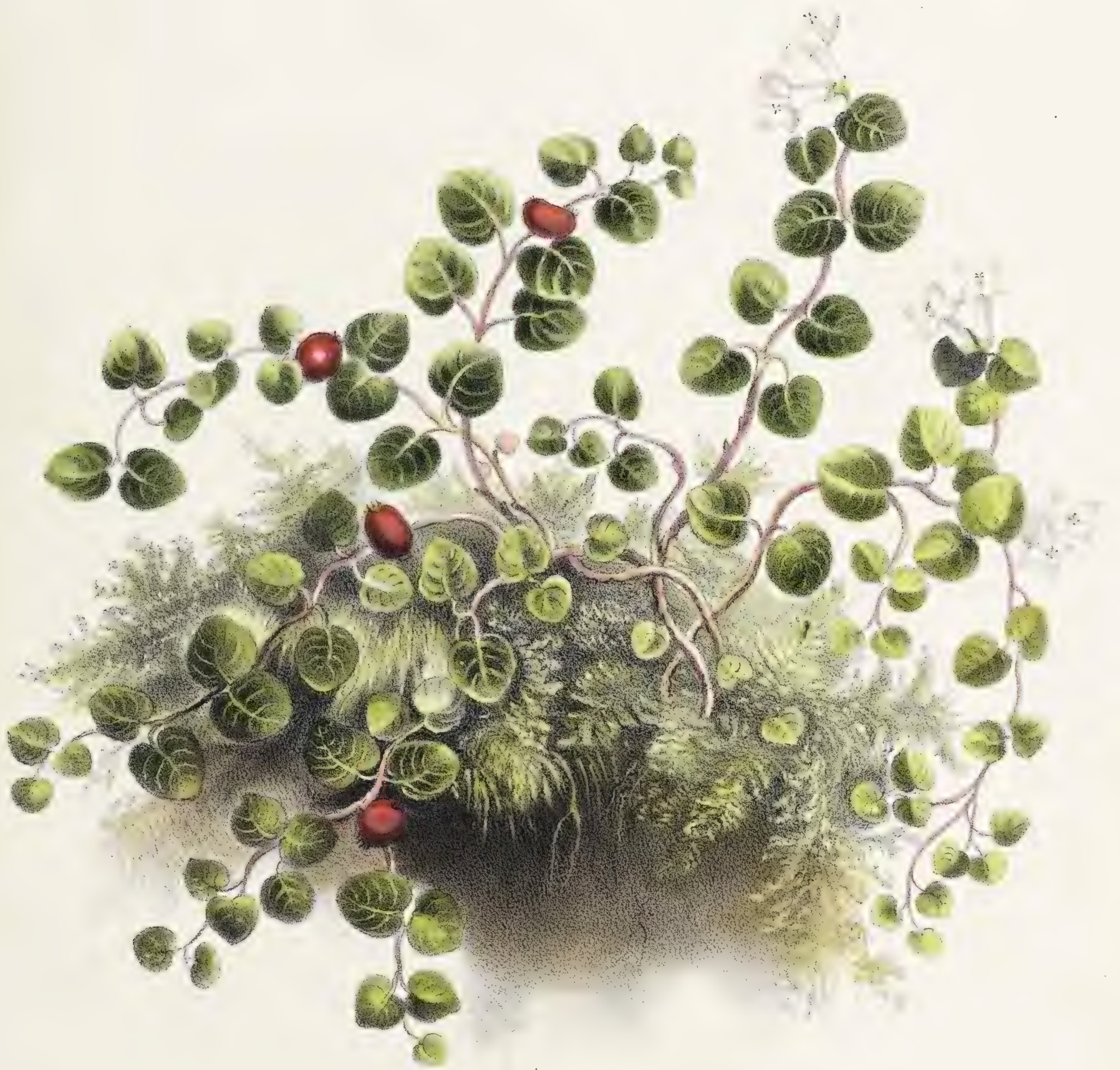
MITCHELLA REPENS . TWIN BERRY .