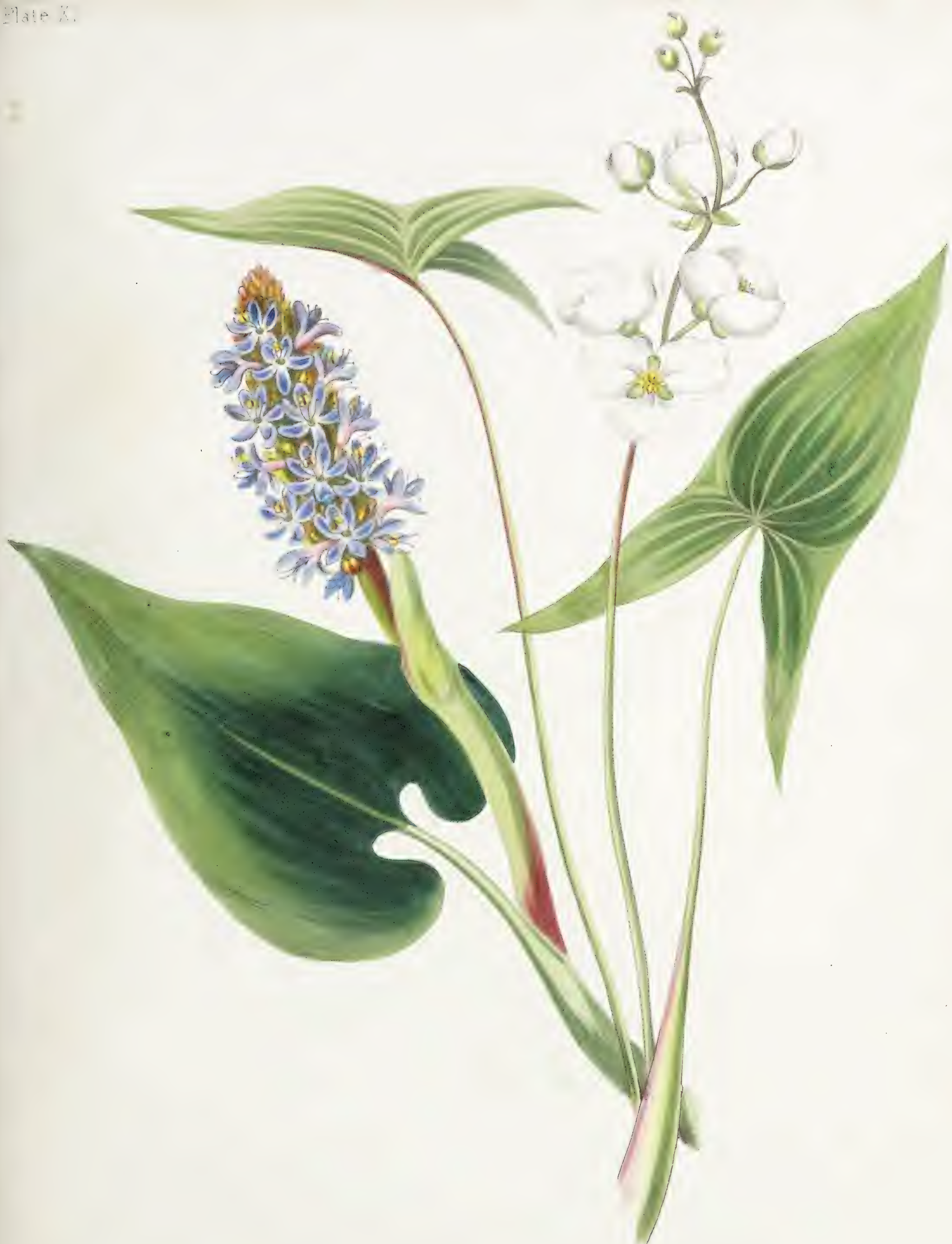
Pontederia Cordata. PICKEREL WEEED