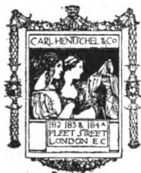
Photo Engravers, Electrotypers, Stereotypers, and Designers.