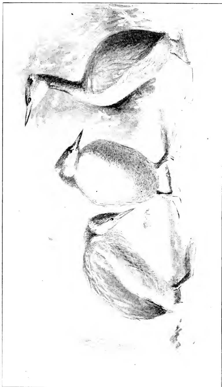
HOLBELL GREBE ( Colymbus holboellii ) IN CHARACTERISTIC ATTITUDES