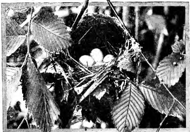
A typical nest of the White-eyed Vireo ( Vireo noveboracensis ). One egg of the Cowbird appears above the lower edge of the nest.