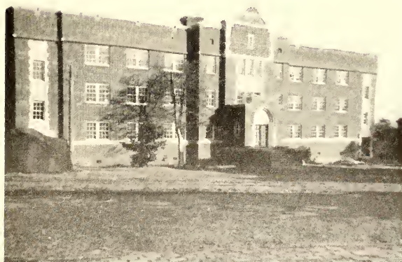
THE ALUMNI BUILDING