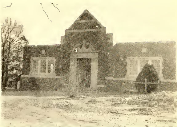
THE EFIRD MEMORIAL LIBRARY