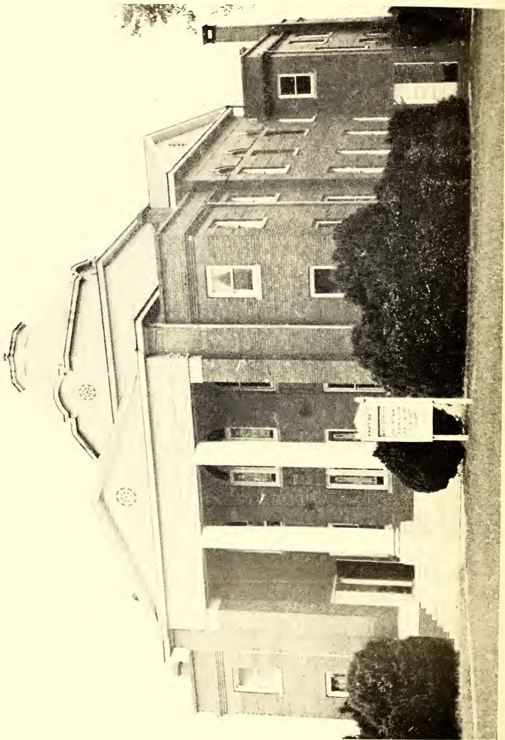
Wingate Baptist Church