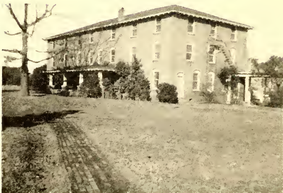
DORMITORY AND CAFETERIA