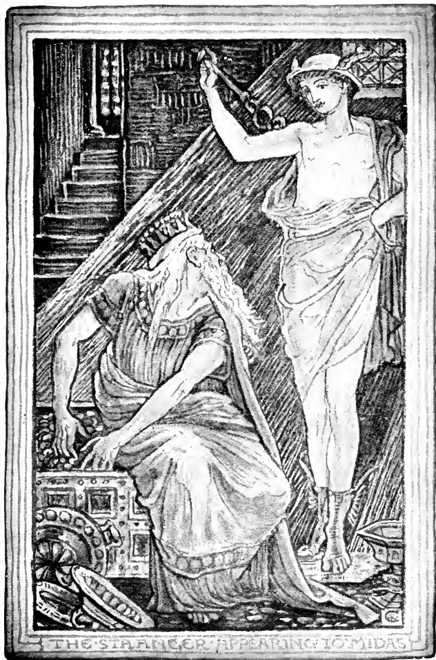
THE STRANGER APPEARING TO MIDAS