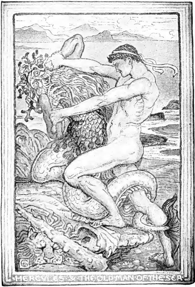
HERCULES & THE OLD MAN OF THE SEA