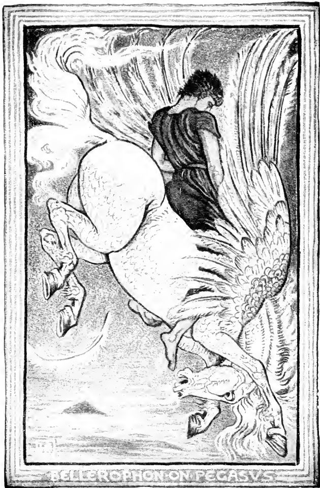
BELLEROPHON ON PEGASUS