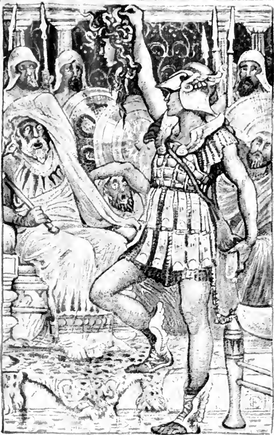
PERSEUS HOLDING THE GORGON'S HEAD.