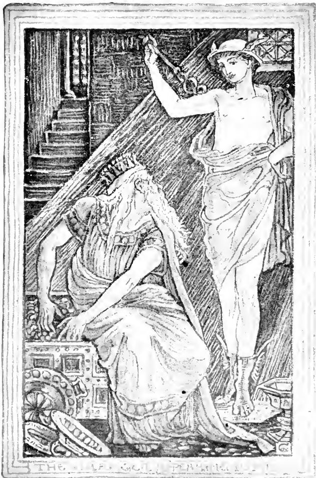
THE KING OF THE JEWS PLAYING HIS PART