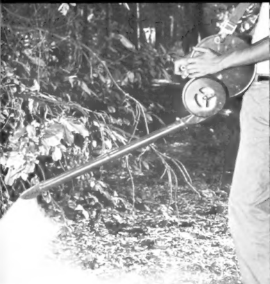
Dusting woodland litter to kill lone star ticks. The applicator is a rotary hand duster.