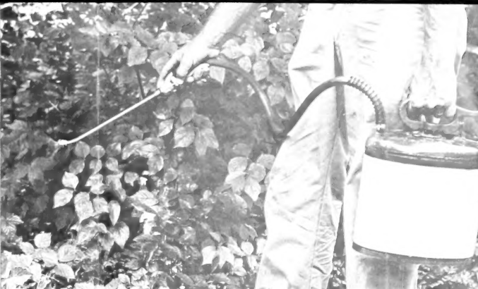
Spraying vegetation to kill American dog ticks. The applicator is a compressed-air sprayer.

To kill American dog ticks and black-legged ticks, spray or dust a strip 20 to 30 feet wide on each side of roads and paths. To kill other species of ticks, treat the entire infested area. (If a survey shows that lone star ticks are concentrated in thickets, treat only those places.)