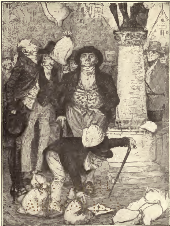
From an etching by Wögel