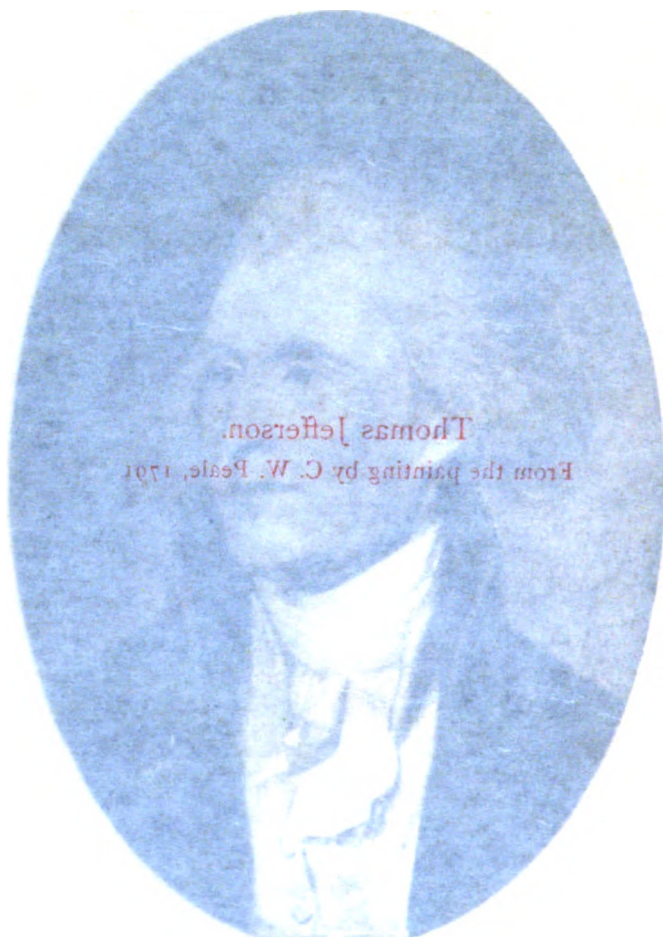
Thomas Jefferson. From the painting by C. W. Peale, 1791.