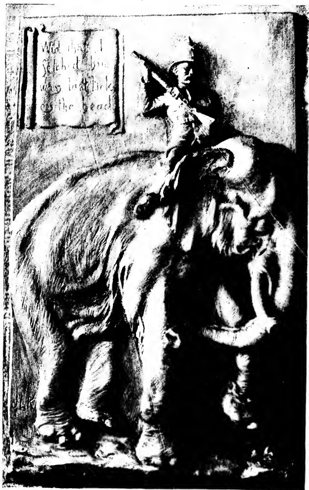
MY LORD THE ELEPHANT.